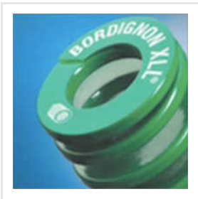
Bordignon Light Load ISO Die-Spring