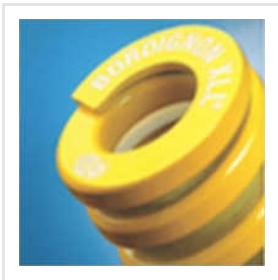
Bordignon Very-Heavy Duty ISO Die-Spring