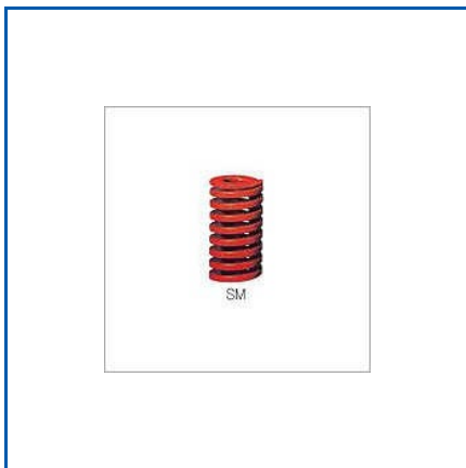
SM DIE SPRINGS

Bordignon Very-Heavy Duty ISO Die-Spring, Bordignon Heavy-Duty ISO Die-Springs, Bordignon Light Load ISO Die-Spring, Bordignon Super Heavy Duty Die-Spring, Bordignon Very Light Die-Springs, HB Feeder Leaflet, Nitrogen Gas Spring, Nitrogen Gas Springs, Router Spindles, SB Die Springs, SF Die Springs, SG Die Springs, SH Die Springs, SL Die Springs, SM Die Springs, etc.