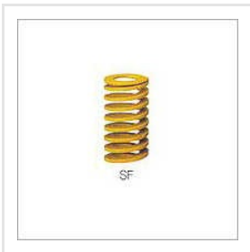
SF Die Springs