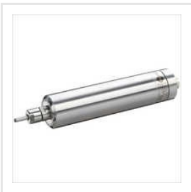
Sycotec H.F. Spindle 4026