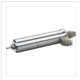
Sycotec H.F. Spindle 4025