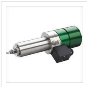
Sycotec H.F. Spindle 4041