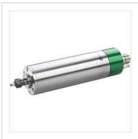
Sycotec H.F. Spindle 4060ER-ERS