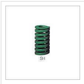
SH Die Springs