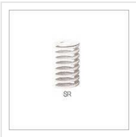
SR Die Springs