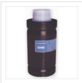
Nitrogen Gas Spring