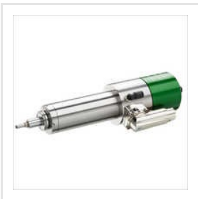
Sycotec H.F. Spindle 4033AC-ESD-LN15