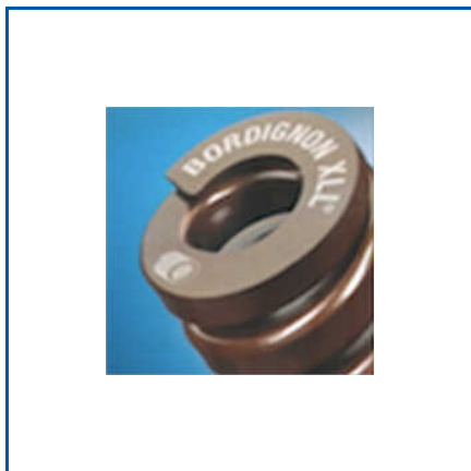
BORDIGNON SUPER HEAVY DUTY DIE-SPRING