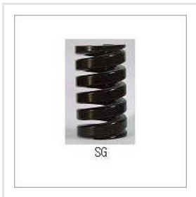
SG Die Springs