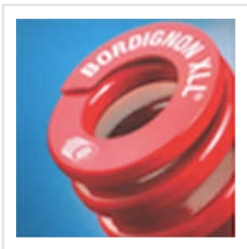
Bordignon Heavy-Duty ISO Die-Springs