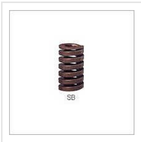
SB Die Springs