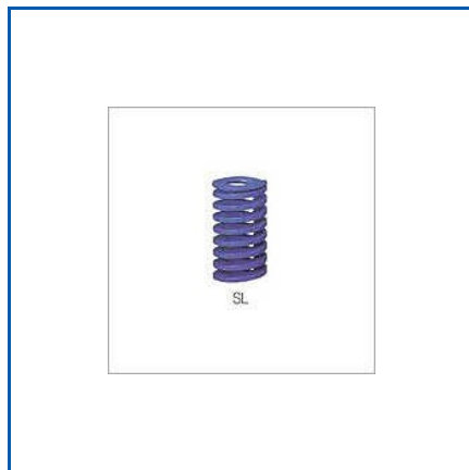
SL DIE SPRINGS