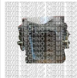
Plastic Can Blow Mould