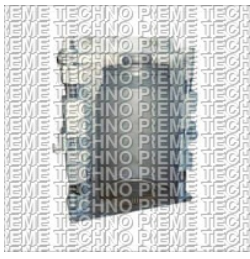
Plastic Drum Blow Mould