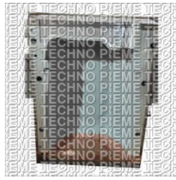
50 Ltr Mild Steel Mould