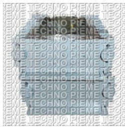
220 Litre Ring Barrel Mould