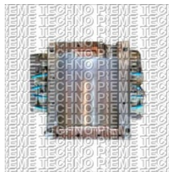
MILD STEEL CONTAINER BLOW MOULD