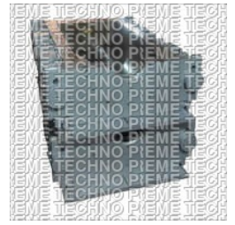
210 Ltr Full Open Top Mould