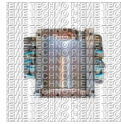
Container Aluminium Blow Mould