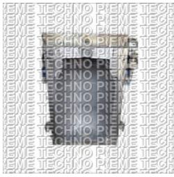
Industrial Blow Mould