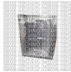
Plastic Container Blow Mould