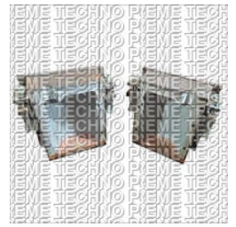
50 Ltr Capacity Mild Steel Moulds