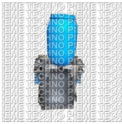
Drum Blow Mould