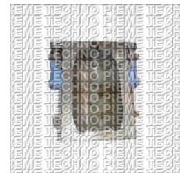
INDUSTRIAL PLASTIC BLOW MOULD