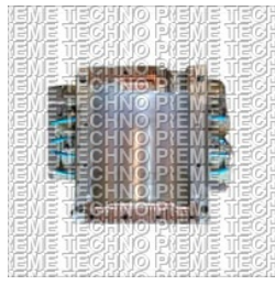
Mild Steel Container Blow Mould