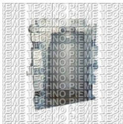
PLASTIC DRUM BLOW MOULD

210 Ltr Full Open Top Mould, 220 Litre Ring Barrel Mould, 50 Ltr Capacity Mild Steel Moulds, 50 Ltr Mild Steel Mould, Container Aluminium Blow Mould, Drum Blow Mould, Industrial Blow Mould, Industrial Plastic Blow Mould, Jerrycan Blow Mould, Mild Steel Container Blow Mould, Plastic Can Blow Mould, Plastic Container Blow Mould, Plastic Drum Blow Mould, Water Tank Blow Mould, etc.