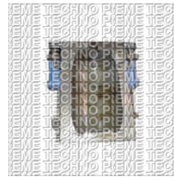
Industrial Plastic Blow Mould