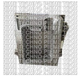
Jerrycan Blow Mould