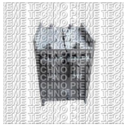
Water Tank Blow Mould