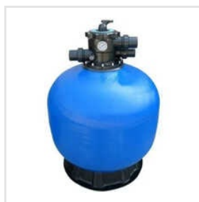
Polyester Sand Filter