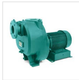
230V Swimming Pool Pump