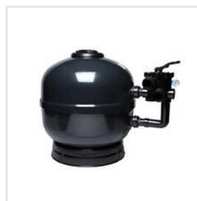
Side Mounted Sand Filter