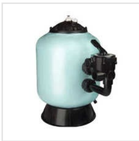
Swimming Pool Sand Filter