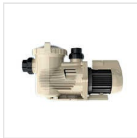
Single Phase Pool Pump