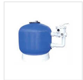
Bobbin Sand Filter