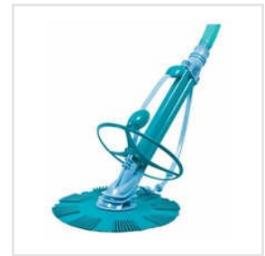
Robotic Automatic Pool Cleaners