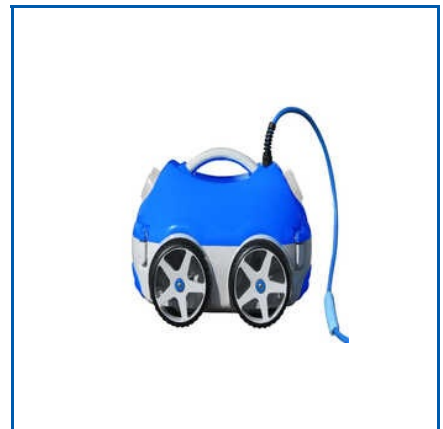
SWIMMING POOL CLEANERS