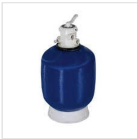
Magnum Commercial Sand Filter