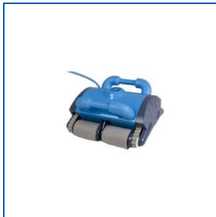
AUTOMATIC POOL CLEANERS