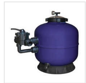
Laminated Sand Filter