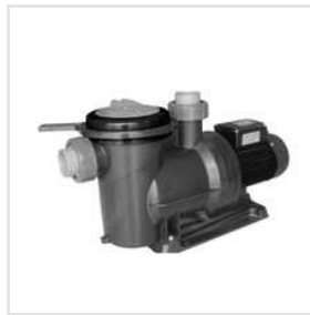
AQL10D01 Marathon Pump