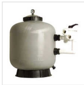
AQL31701 Commercial Sand Filter