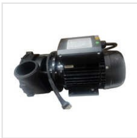
Jacuzzi Pump Motor