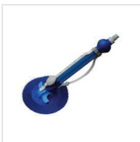
Automatic Cleaner Explorer