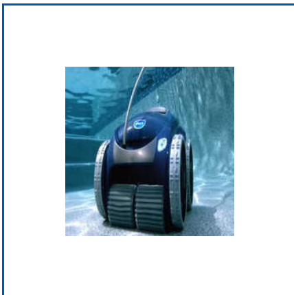
ROBOT POOL CLEANER

1 Seater Beach Bed, 230V Swimming Pool Pump, APT 50 Sparata Pump, AQL10201 Sand Filter, AQL10601 Wall Handrail Ladder, AQL10D01 Marathon Pump, AQL20603 White LED Underwater Light, AQL31701 Commercial Sand Filter, AQL5015BU Swimming Pool Wall Cleaning Brushes, Aluminium Vacuum Head, Automatic Cleaner Explorer, Automatic Pool Cleaners, Automatic Swimming Pool Cleaner, Blue FRP Swimming Pool For Amusement, Bobbin Sand Filter, etc.