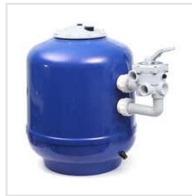
AQL10201 Sand Filter