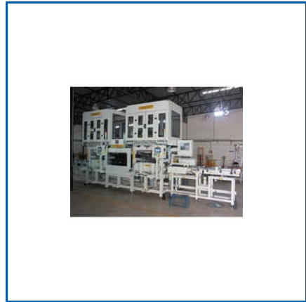
INDUSTRIAL SERVO PRESS SYSTEM