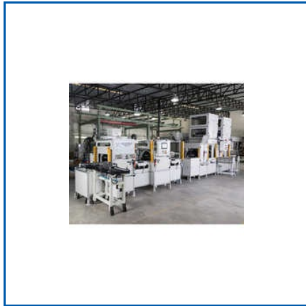
INDUSTRIAL ASSEMBLY AND AUTOMATION SYSTEM