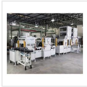
Industrial Assembly And Automation