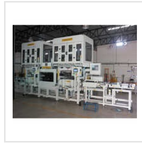
Industrial Servo Press System