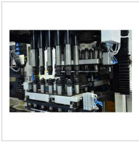
Industrial Nut Runner System