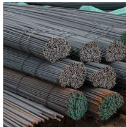
INDUSTRIAL MS TMT BAR