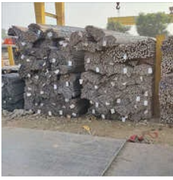
MS TMT Bar