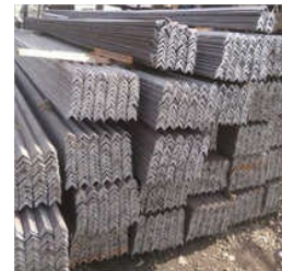
INDUSTRIAL MS ANGLE