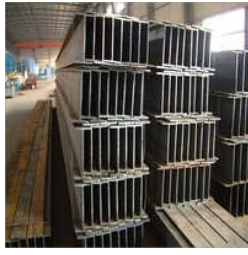
Industrial Steel I Beam