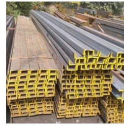
Industrial MS Channel