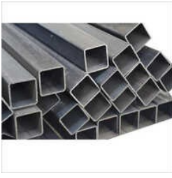
Industrial MS Square Pipe