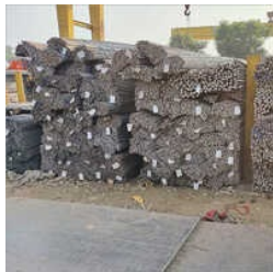
MS TMT BAR

Industrial MS Angle, Industrial MS Channel, Industrial MS Coil, Industrial MS Plate, Industrial MS Square Pipe, Industrial MS TMT Bar, Industrial Steel I Beam, MS TMT Bar, etc.