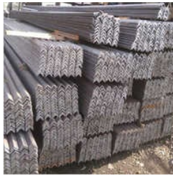
Industrial MS Angle