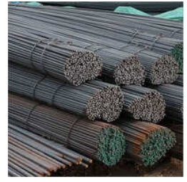
Industrial MS TMT Bar