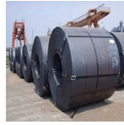
Industrial MS Coil