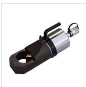
Industrial Nut Splitter