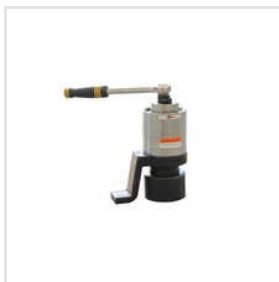
Slim Type Manual Torque Multiplier