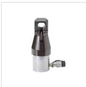
Hydraulic Nut Splitters