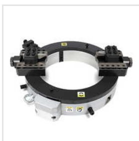
Industrial Pipe Cutting Machine