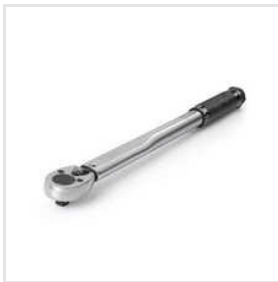
Manual Torque Wrench