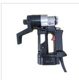
Electric Torque Wrench