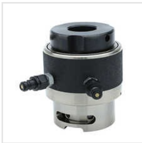
Industrial Bolt Tensioners