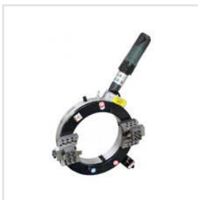
Electric Type OCE Series Pipe Cutting Machine