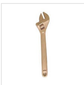
Metal Non-Sparking Tools