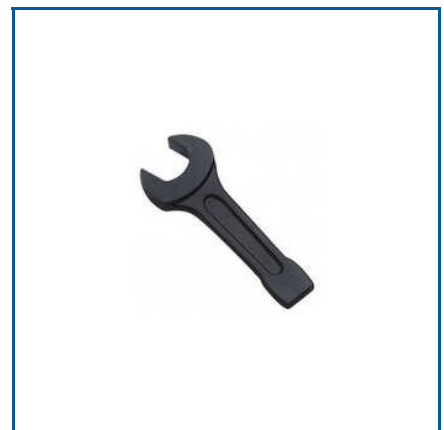
OPEN TYPE SLUGGING WRENCH