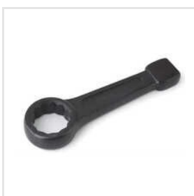
Ring Type Slugging Wrench