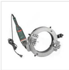
Electro Metabo Type OCM Series Pipe