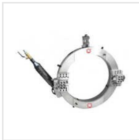
Pneumatic Type OCP Series Pipe Cutting