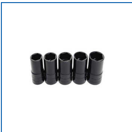
THIN WALL IMPACT SOCKETS

Electric Impact Wrench, Electric Torque Wrench, Electric Type OCE Series Pipe Cutting Machine, Electro Metabo Type OCM Series Pipe Cutting Machine, Electro Servo Type OCS Series Pipe Cutting Machine, Hydraulic Nut Splitters, Hydraulic Power Pack, Industrial Bolt Tensioners, Industrial Nut Splitter, Industrial Pipe Cutting Machine, Manual Torque Multiplier, Manual Torque Wrench, Metal Crowfoot Wrench, Metal Non-Sparking Tools, Open Type Slugging Wrench, etc.