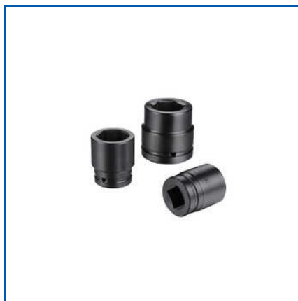
STANDARD IMPACT SOCKETS