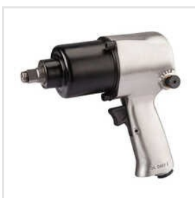
Electric Impact Wrench Machine