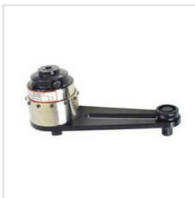
Manual Torque Multiplier