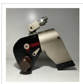
Square Drive Torque Wrench