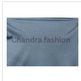
Apple Zurick 4 Way Tex Lycra