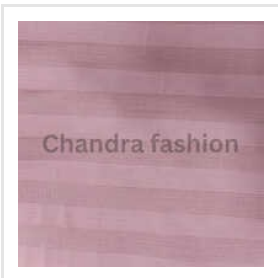
Snowfall Polo Stripe Fabric