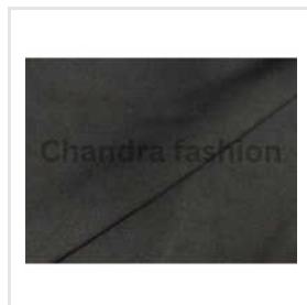
Zoya Zurick 4 Way Micro Fabric