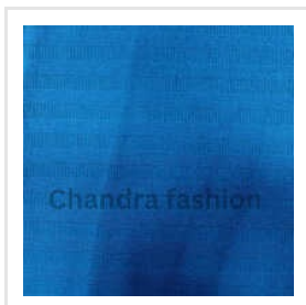
Jaquard Patta Fabric