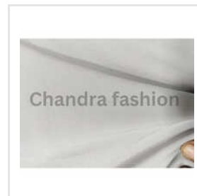
Zara Zurick 4 Way Micro Fabric