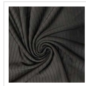
Bump Zurick Fabric