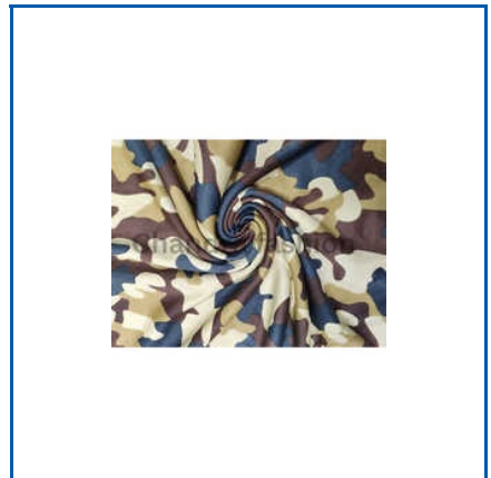
ARMY PRINT 2 WAY FABRIC