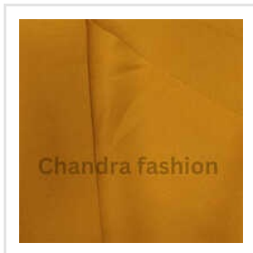
Scuba Lycra Fabric