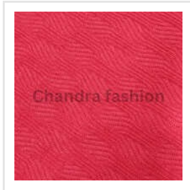
4 Way Lycra 250 GSM Fabric