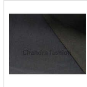
SPA Lycra Fabric