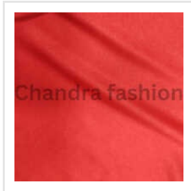
Adidas 2 Way Lycra Fabric