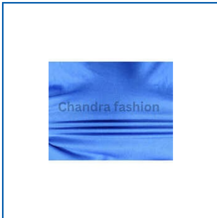
2 WAY LYCRA FABRIC

110-120 GSM Sarina Lycra Fabric, 160-170 GSM Softy Lycra Fabric, 160-180 GSM Softy Lycra Fabric, 2 Way Lycra Fabric, 2 Way Print Dry Fit Fabric, 2 Way Print Fabric, 2 Way Print Shirt Fabric, 2.75 Mtr-Kg Zara Micro Zurick 4 Way Lower Fabrics, 2.75 Mtr-kg Zara Micro Zurick 4 Way Dry Fit Fabric, etc.