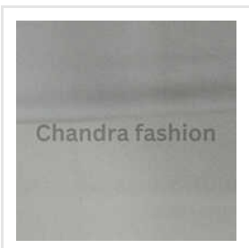
Zurick 4 Way Lycra Fabric