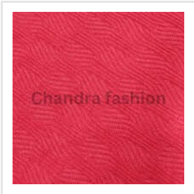
4 Way Lycra 10 Percent Spandex