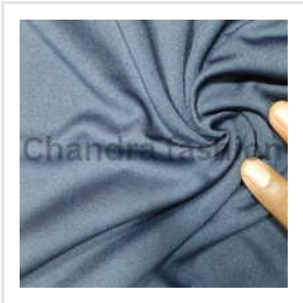
Puma 2 Way Lycra Fabric