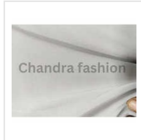
Zara Zurick 4 Way 2 Micro Fabric