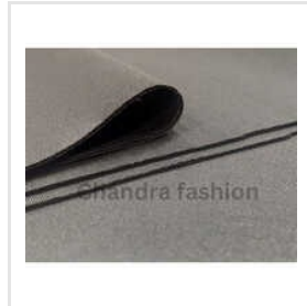
Sandwich Lycra Fabric