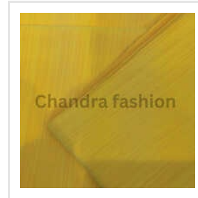
Snowfall Fulldull Lycra Fabric