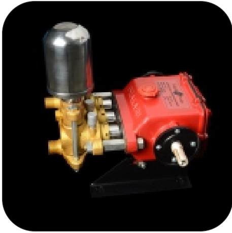
Water Spray Piston Pumps