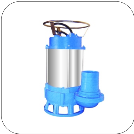
Submersible Dewatering Pump