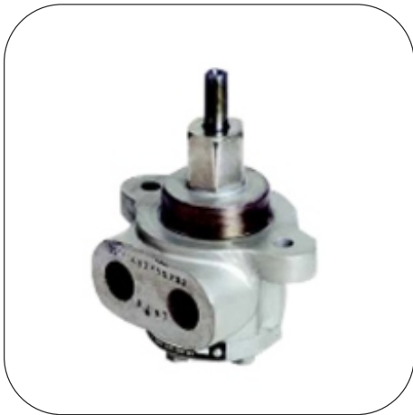
Pump Without Pressure Relief Valve