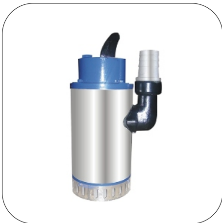
Portable Dewatering Pump