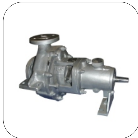
Centri Process Pumps