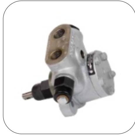
Pump With Pressure Relief Valve