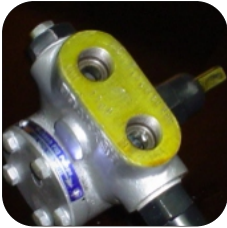
Fuel Injection Gear Pump