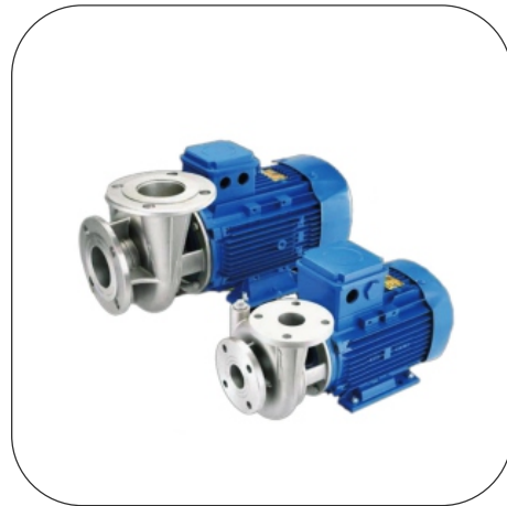
DCS Stainless Steel Motorpump