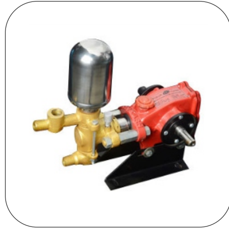
Water Piston Pumps