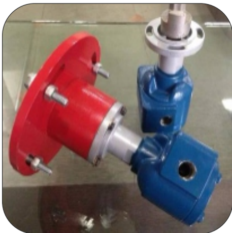
Seal Cooling Pumps