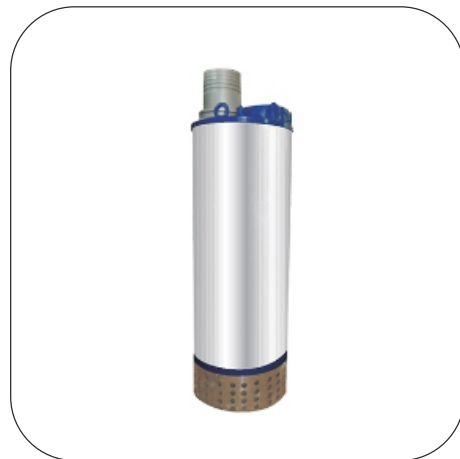
Dewatering Water Pump