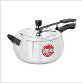
5 Ltr Stainless Steel Pressure Cooker