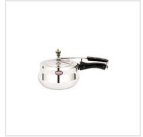
3.5 Ltr Handi Pressure Cooker