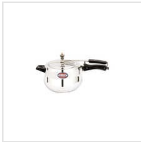
5.5 Ltr Aluminium Handi Pressure Cooker