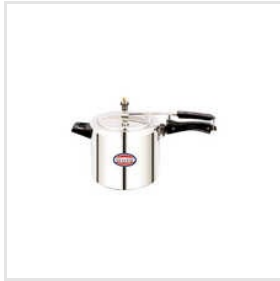
2.5 Ltr Aluminium Cooker