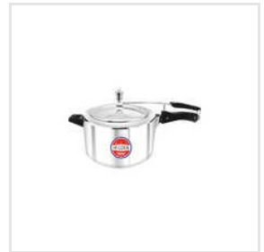
8 Ltr Pressure Cooker