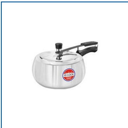
3 LTR STAINLESS STEEL PRESSURE COOKER