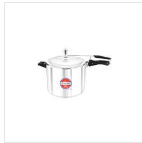
12 Ltr Pressure Cooker