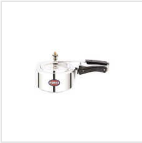
3 Ltr Pressure Cooker