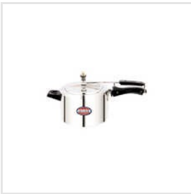
5 Ltr Inner Lid Pressure Cooker