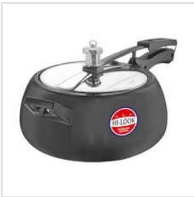
Hi Look Black Pressure Cooker