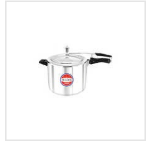
10 Ltr Pressure Cooker