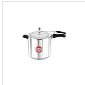
15 Ltr Pressure Cooker