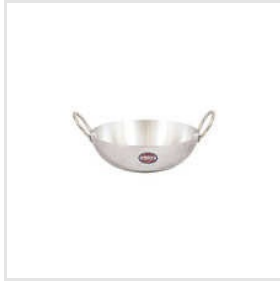
Gol Aluminium Kadai