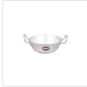
Bridging Aluminium Kadai