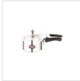
1.5 Ltr Pressure Cooker