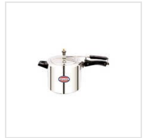
6.5 Ltr Aluminium Lid Cooker