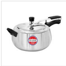
Hi Look Contura White Pressure Cooker