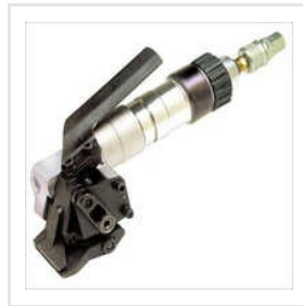
Push-Type Feedwheel For Round Or Irregular