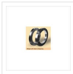
Magnus Steel Strapping