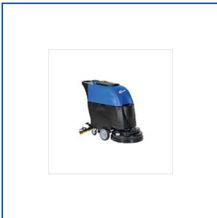
FLOOR CLEANING MACHINE

Apex Steel Strapping, Automatic Box Strapping Machine MB 1 Features, Battery Powered sealer for steel Strapping Geny 114S, Bopp Tape, Box Strapping Machine, Carton Wrapping Machine, Container Lashing, Contrax Polypropylene Strapping, Conveyor System, Coral 65 Ride on Industrial Scrubber Drier, Coral 85 Ride on Industrial Scrubber Drier, Corner Edge Protection, DULEVAC BP Professional Floor Vacuum Cleaner Machine, DULEVO Professional Sweepers, DULEVO Vacuum Cleaners, etc.