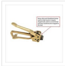
Push-Type Feedwheel For Round Or Irregular