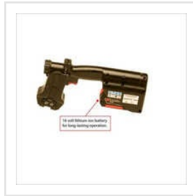
Battery Powered Sealer For Steel Strapping