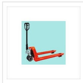
Industrial Hand Pallet Truck