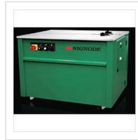
Box Strapping Machine