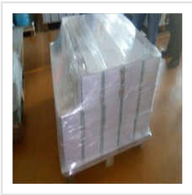
Machine Grade Films