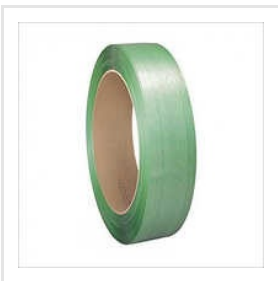
Tenax Polyester Strapping