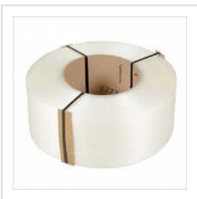
Contrax Polypropylene Strapping