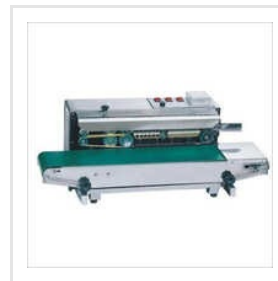
Pouch Sealing Machine