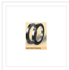
Apex Steel Strapping