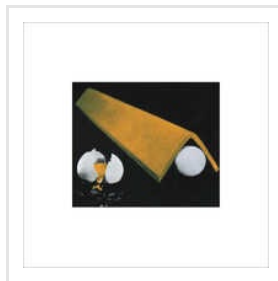
Corner Edge Protection