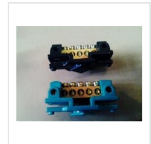
Brass Neutral Link With Base