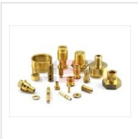
Brass CNC Turned Component