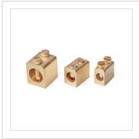
Brass Electrical Terminal Connector