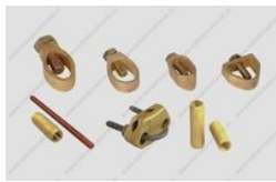
BRASS EARTHING ACCESSORIES

5mm Round Brass Inserts, Brass Automobile Component, Brass CNC Turned Component, Brass Earthing Accessories, Brass Electrical Terminal Connector, Brass Hex Bolts, Brass Moulding Insert, Brass Neutral Link with Base, Brass insert, Brass pin, Copper Neutral Link, Electrical Copper Bush Bar, High Quality Brass Earthing Accessories, Nickel Plated Brass Neutral Link, Tin Plated Aluminium Neutral Link, etc.