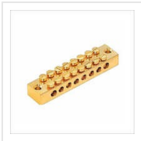
Nickel Plated Brass Neutral Link