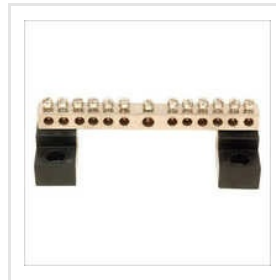
Copper Neutral Link