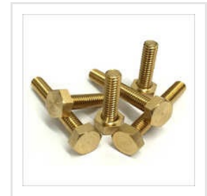
Brass Hex Bolts