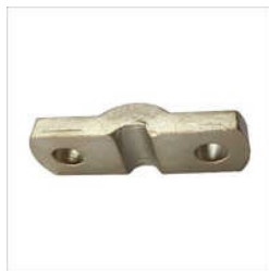
HIGH QUALITY BRASS EARTHING ACCESSORIES