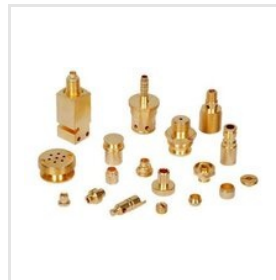
Brass Automobile Component