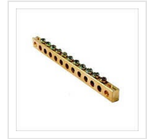
Tin Plated Brass Neutral Bar