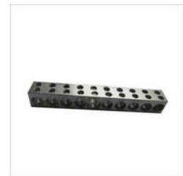
TIN PLATED ALUMINIUM NEUTRAL LINK