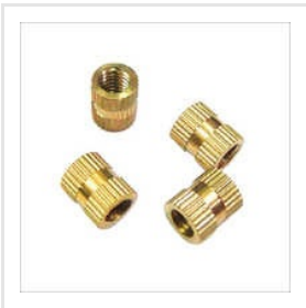
Brass Moulding Insert