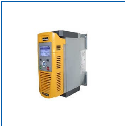
PARKER AC30V DRIVE

590P 165A 4Q Parker SSD DC Drive, 690P Size B Parker SSD Encoder Feedback Card AC Drive, AC-DC Drive Repair Services, DC590P Drive Control Card, Parker 512C - 16A Analog DC Drive, Parker 512C - 32A Analog DC Drive, Parker 512C - 8A Analog DC Drive, Parker 514C - 16A Analog DC Drive, Parker 514C - 32A Analog DC Drive, etc.