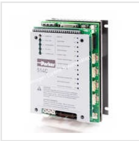
Parker 514C - 32A Analog DC Drive