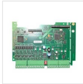
Parker SSD SHTTL Dual Encoder Board And