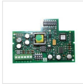
690P Size B Parker SSD Encoder Feedback