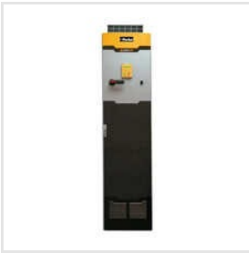
Parker AC890PX Series AC Variable Frequency