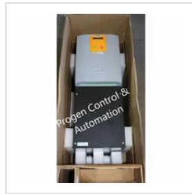
Parker 590P 830A 4Q DC Drive