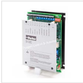
Parker 512C - 8A Analog DC Drive