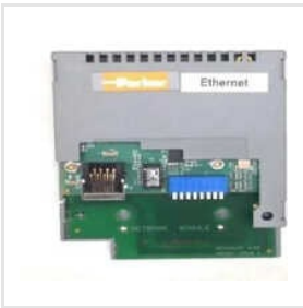
Parker SSD EtherNet Comms Module For