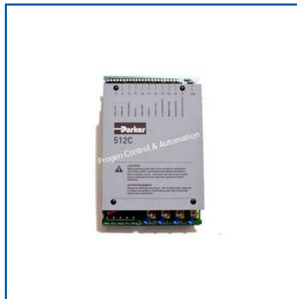
PARKER 512C - 16A ANALOG DC DRIVE