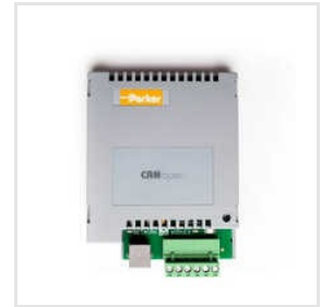
Parker SSD CanOpen Comms Card For