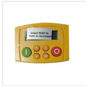
Parker AC890 Membrane Keypad