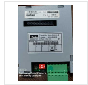
Parker SSD RS485, RS422, Modbus RTU, EI