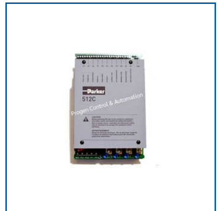
PARKER 512C - 32A ANALOG DC DRIVE