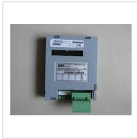
Parker SSD Profibus Comms Card For