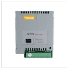
Parker 690P Encoder Feedback Card For