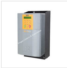
590P 165A 4Q Parker SSD DC Drive