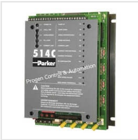
Parker 514C - 16A Analog DC Drive