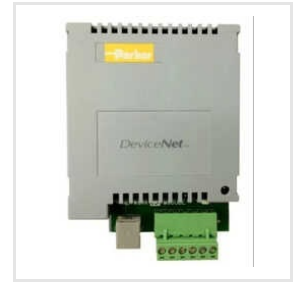
Parker SSD DeviceNet Comms Card For