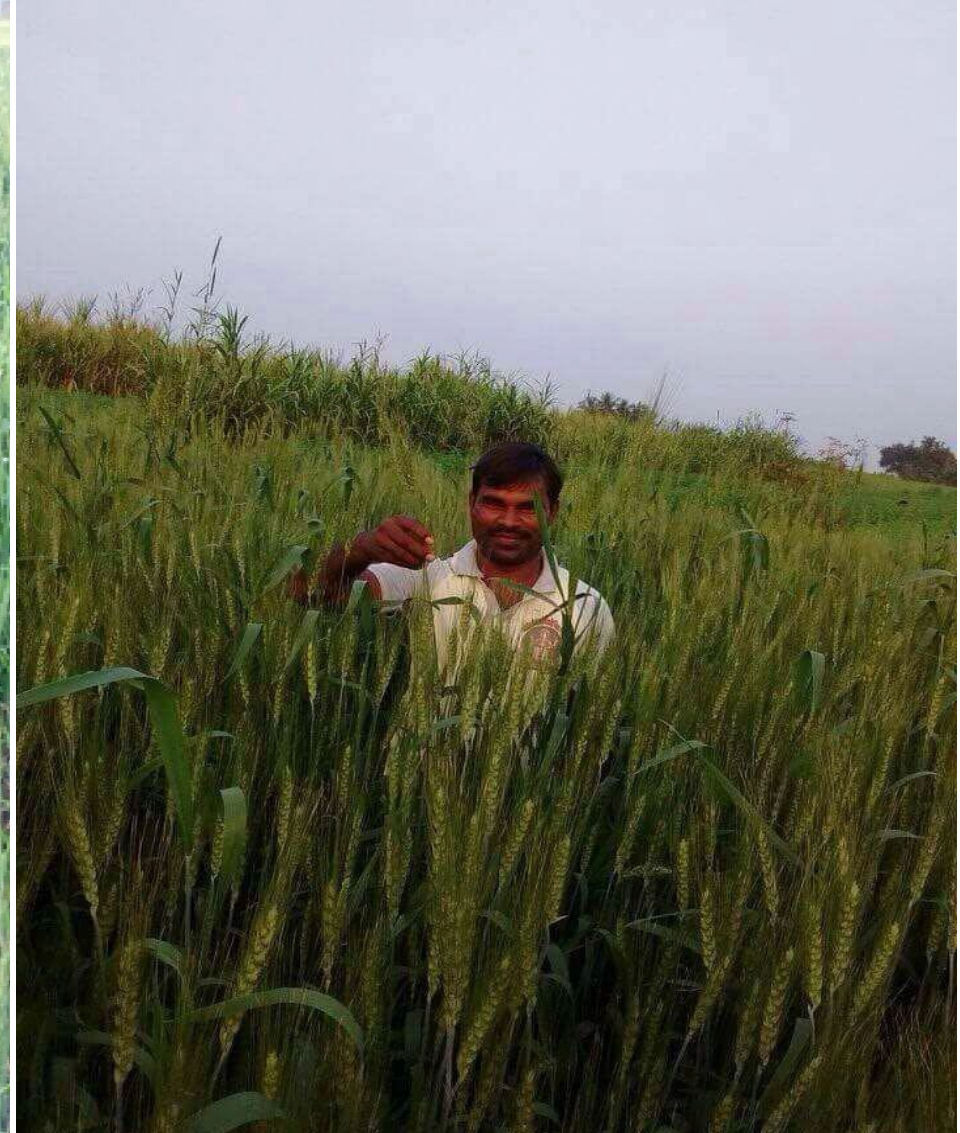
Treated Hard Water