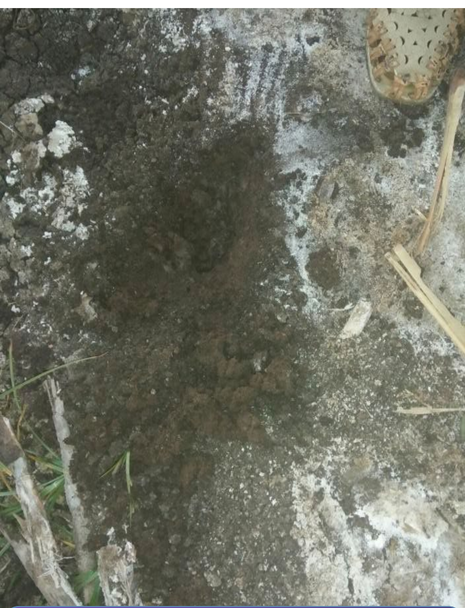
Saline soil due to very hard water