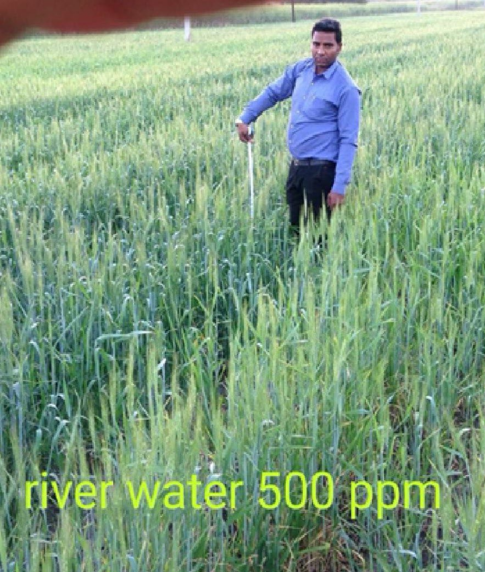
Normal River Water