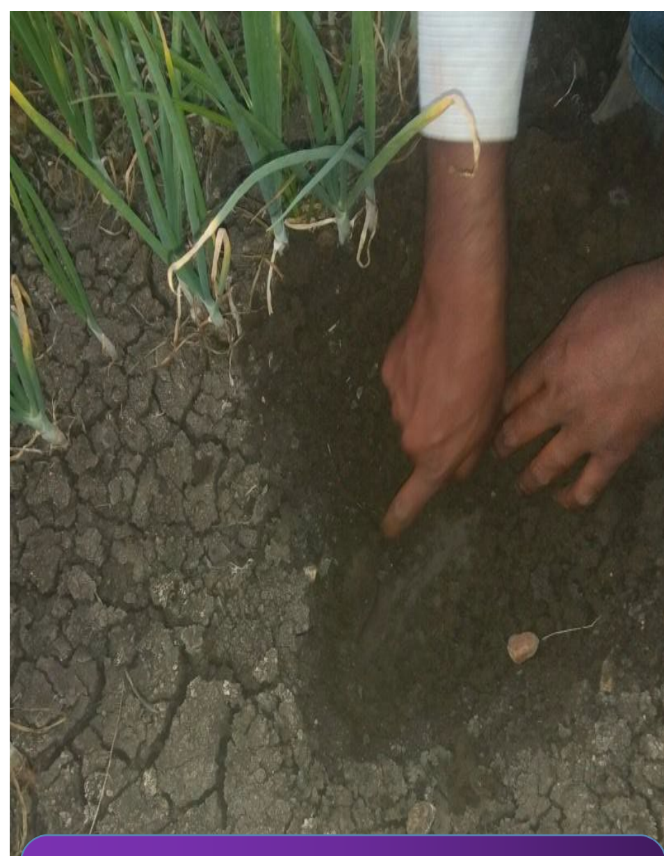
100 % desalinated soil after two years