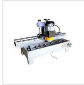
Fully Automatic Knife Grinding Machine