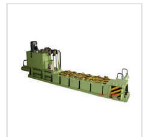
Horizontal Hydraulic Baling Press