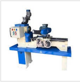
Circular Carbide Cutter Resharpener Machine