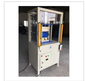
Pneumatic Servo Press - Pin Bend Machine