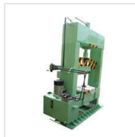
Hydraulic Rubber Bale Cutting Press