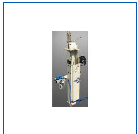
02_PNEUMATIC PULL WINDING MACHINE