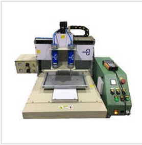
3 Axis Glue Dispensing Machine