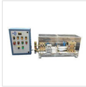
Automatic Pin Cut And Bend Machine