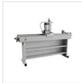
Industrial Knife Grinding Machine