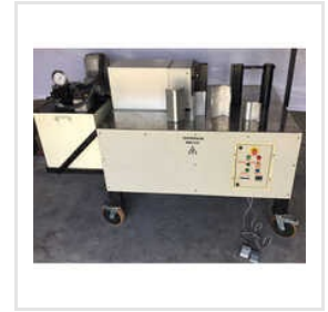
Automatic Hydraulic Plate Bending Machine