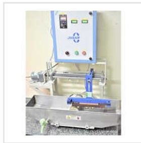
Automatic Pull Winding Machine