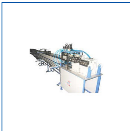
FULL AUTOMATIC PLC CONTROLLED CUT TO LENGTH MACHINE