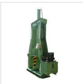
Hydraulic Wood Cutting Machine