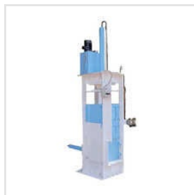
Vertical Hydraulic Baling Press