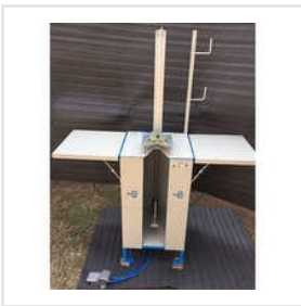
01_Pneumatic Pull Winding Machine