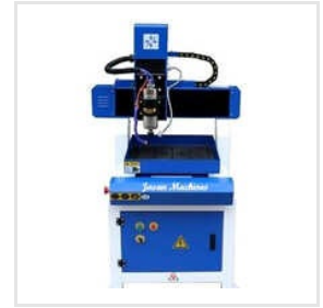
Industrial CNC Engraving Machine