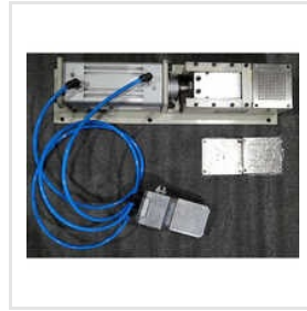
Pneumatic Wire Trimming Machine