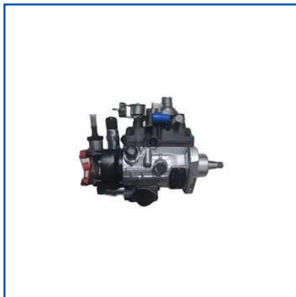
JCB FIP PUMP