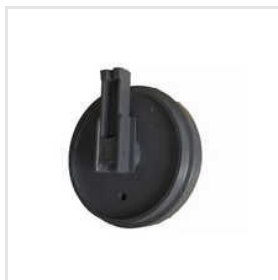
JCB Iron Idler Pulley