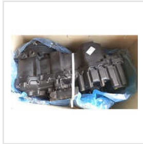
JCB 432ZX Translation Assembly