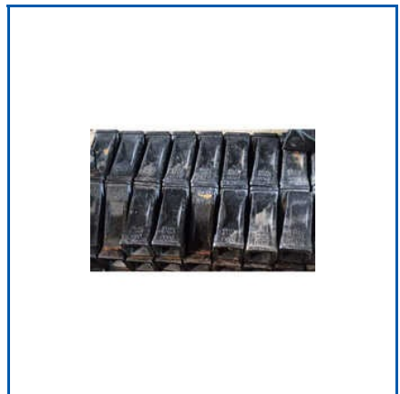
JCB EXCAVATOR TEETH