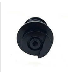
Excavator Track Roller Assembly