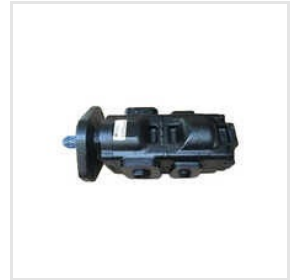
JCB Hydraulic Pump