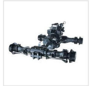
JCB Excel Transmission