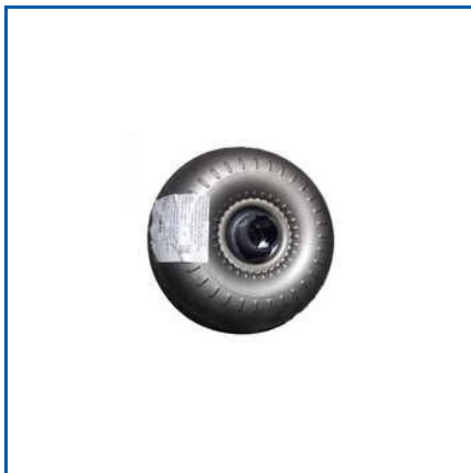
JCB TORQUE CONVERTER

432ZX Break Seal Ring, Cutter Kit 3DX, Diesel Generator, Excavator Track Roller Assembly, Fuel Filter Assembly, G63Q I Generator, JCB 225LC ECO Plus Excavator, JCB 380LC Quarry Master Excavator, JCB 380LC Xtra Excavator, JCB 3DX XTRA Backhoe Loader, JCB 432ZX Translation Assembly, JCB 432ZX Transmission Gear Box, JCB 540 140 Hi Viz Telescopic Handler, JCB Air Filter, JCB Breaker, etc.