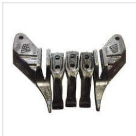
JCB Cutter Kit