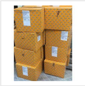
JCB Filter Kit