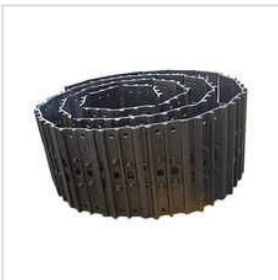
JCB Track Chain