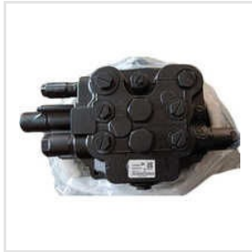
JCB Wall Block