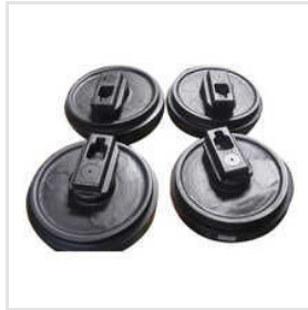
JCB Track Idler