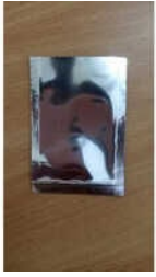
Plain Silver Pouch