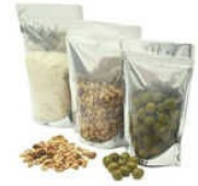
One Sided Transparent Zipper Sealed Pouch