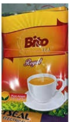
Printed Tea Packaging Pouch