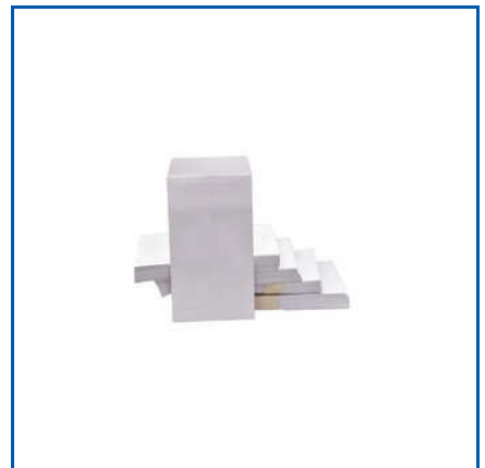
9X4.5 INCH WHITE ENVELOPES