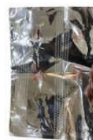
Printed Silver Pouches