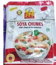
Soya Chunks Printed Pouches