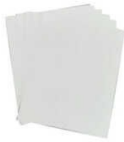
10x12 Inch White Envelopes