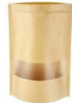
Brown Paper Stand Up Pouch