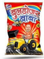
Snack Food Packaging Pouch