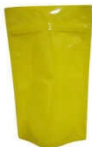
Glossy And Matte Finish Stand Zipper