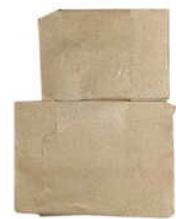
Photo Studio Brown Envelopes