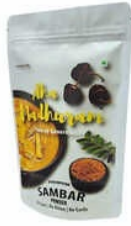
Digital Printed Stand Zipper Pouch