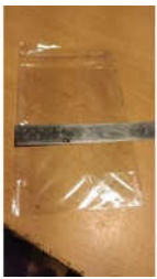
Bopp Self Adhesive Poly Bags