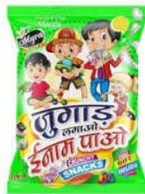
Center Seal Pouches