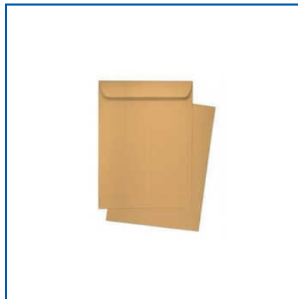
BROWN MEDICINE ENVELOPES