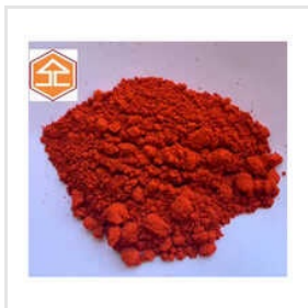
Yellow 14 Solvent Dyes