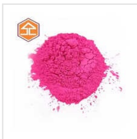
Red 49 Solvent Dyes