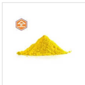
Yellow 12 Chrysophenine G