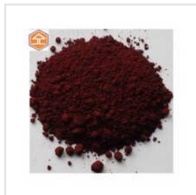
Red 24 Solvent Dyes