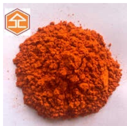
TARTRAZINE FD&C YELLOW 5 FOOD GRADE COLOR

1325-37-7 Yellow 11 Paper Direct Dyes, 3248-91-7 Basic Magenta Lumps, 3626-36-6 Orange 26 Direct Dyes, Acid Red 119 Maroon V Acid Dyes, Basic Green 4 Malachite Green Dyes, Blue 9 Acid Dyes, Brown 1 Basic Dyes, Brown 1 Bismark Brown Y Basic Dyes, Brown 4 Bismark Brown R Paper Basic Dye, Green 1 Diamone Green Basic Dyes, etc.