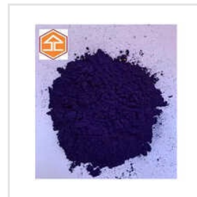
Violet 9 Solvent Dyes