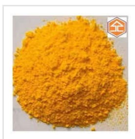
Yellow 56 Solvent Dyes