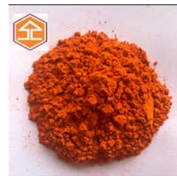
TARTRAZINE FD&C YELLOW 5 FOOD COLOR AND ADDITIVE