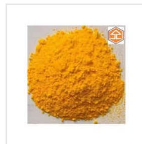
Yellow 56 Solvent Dyes