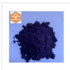
Violet 8 Methyl Violet Base Solvent Dyes