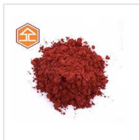
Orange 39 Direct Dyes