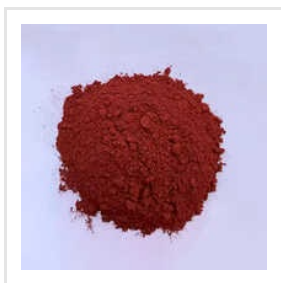
3626-36-6 Orange 26 Direct Dyes