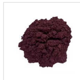
1325-37-7 Yellow 11 Paper Direct Dyes