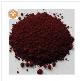
Red 24 Solvent Dyes