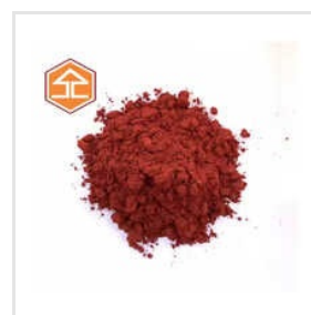
Orange 39 Direct Dyes