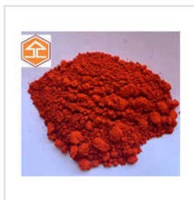
Yellow 14 Solvent Dyes For Wax