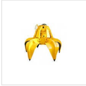
Orange Peel Grab Bucket