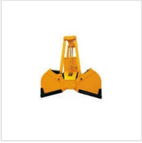
Clamshell Grab Bucket