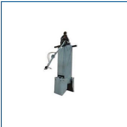
FOUNDRY SLAG SKIMMER SYSTEM

Automatic Ladle Transfer Car, Automatic Water Treatment Plant, Clamshell Grab Bucket, Continuous Casting Machine, DM Water Plant, Electric Arc Furnace, Excavators Grab Bucket, FRP Cooling Towers, Foundry Slag Skimmer System, Four Rope Mech Grab Bucket, Fully Automatic Hydraulic Scrap Pusher, HT Control Panel, Heavy Duty Slag Pot, High Voltage Electric Transformer, High Voltage Transformer, etc.