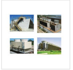
Induced Draft Wooden Cooling Tower