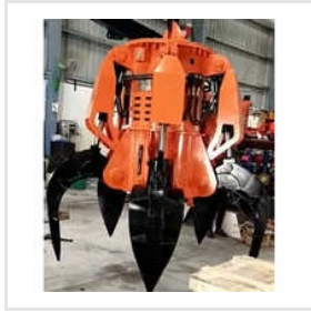
Orange Peel Grab Bucket