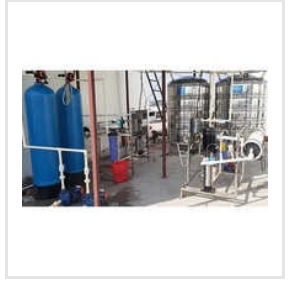
DM Water Plant