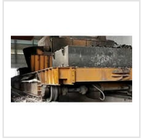
Automatic Ladle Transfer Car