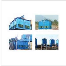
FRP Cooling Towers