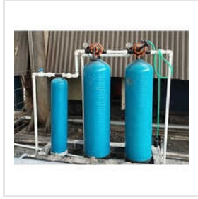
Reverse Osmosis Plant