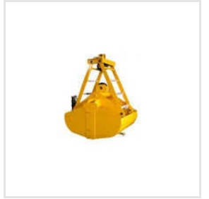
Mill Scale Grab Bucket