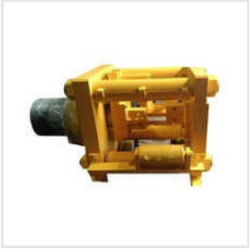
Horizontal Shearing Machine