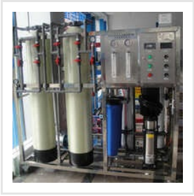
Automatic Water Treatment Plant