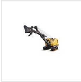
Excavators Grab Bucket