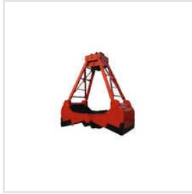
Four Rope Mech Grab Bucket