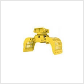
Log Grab Bucket