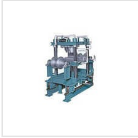
Vertical Billet Shearing Machine