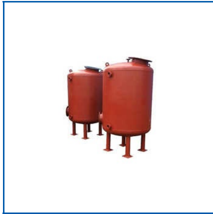
STEEL STORAGE TANK