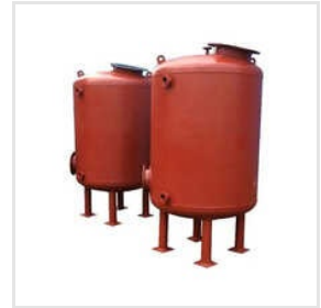
Steel Storage Tank