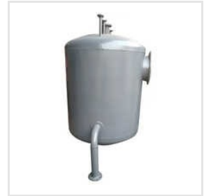
Mild Steel Pressure Vessel