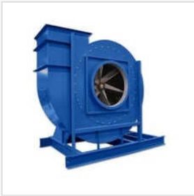
Industrial Blower Fan