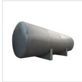
Oil Storage Tank