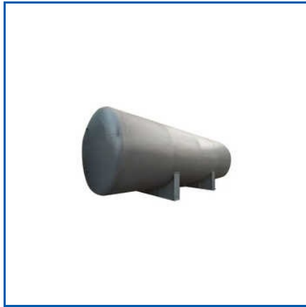
OIL STORAGE TANK