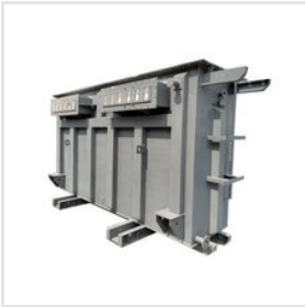
Fabrication Of Electrical Transformer