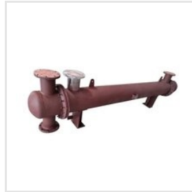
Industrial Heat Exchanger