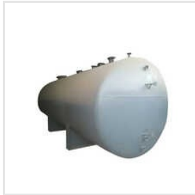
Mild Steel Oil Storage Tank