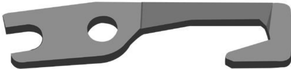
MO-P-05 OTHER SIDE