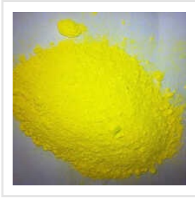
Zinc Chromate Powder