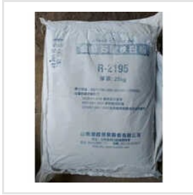
R2195 Titanium Dioxide Rutile Dawn