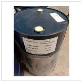
Phosphorus Oxchloride Chemical