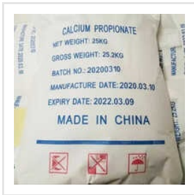
Calcium Propionate Chemical