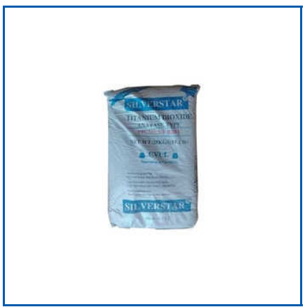
B101 ANATASE GRADE TITANIUM DIOXIDE