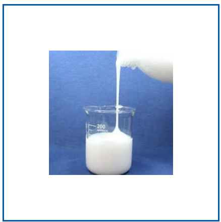
SILICONE DEFOAMER LIQUID