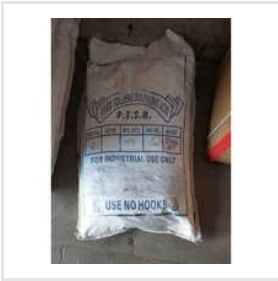
Para Sulfonic Acid