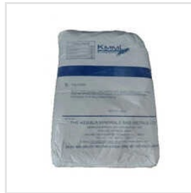
RC 822 Titanium Dioxide Rutile Kmml