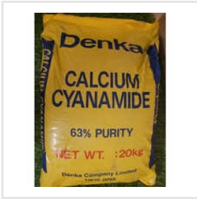
20 Kg Calcium Cyanamide