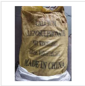
Calcium Lignosulfonate Powder