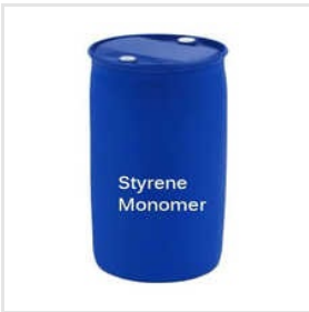
Liquid Styrene Monomer