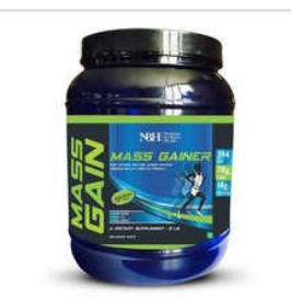
Food Supplements Manufacturing Service