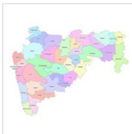
Third Party Manufacturer For