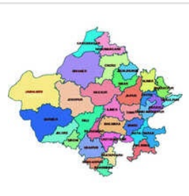
Third Party Manufacturer In