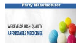
THIRD PARTY MANUFACTURER FOR PHARMA