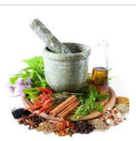
Third Party Manufacturer For