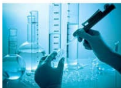
THIRD PARTY MANUFACTURER

Baby Food Supplement, Baby Food Suppliment, Contract Manufacturing Service, Dietary Supplements, Dietary Supplements Manufacturing Service, Food Supplement, Food Supplement Mass Gainer, Food Supplements Manufacturing Service, Immunity Booster Syrup, Multi-Vitamin Tablets, Nutraceutical – Pharmaceutical Formulation, Nutraceutical Formulation, Nutraceutical Manufacturing Service, Nutraceutical Manufacturing Services, Organic Food Supplement, etc.