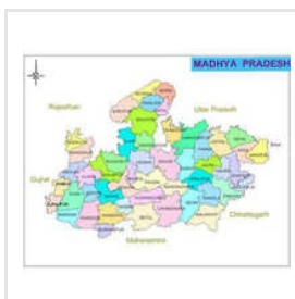
Third Party Manufacturer In