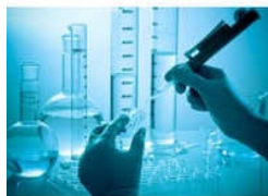
THIRD PARTY MANUFACTURING SERVICE