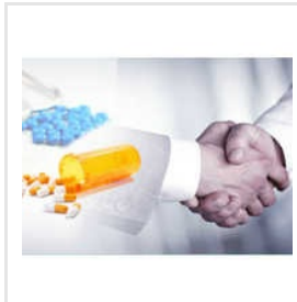
Contract Manufacturing Service