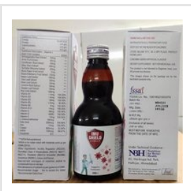
Immunity Booster Syrup