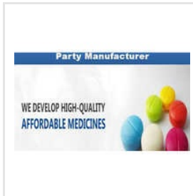
Pharma Third Party Manufacturing Service