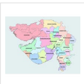
Third Party Manufacturer In