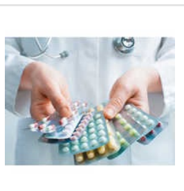
Third Party Nutraceuticals