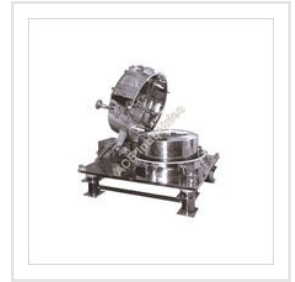
Bottom Discharge Centrifuge Machine