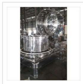
Pharma Centrifuge Machine