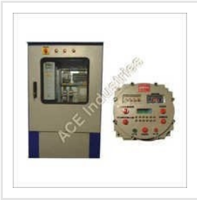
Automation Of Bottom Discharge Centrifuge