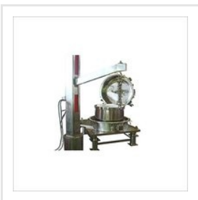
Full Body Top Opening Centrifuge