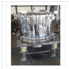
Filtration Centrifuge Machine