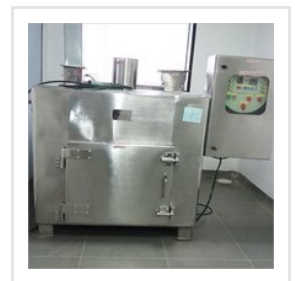
Air Tray Dryer