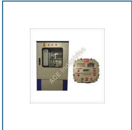
AUTOMATION OF BOTTOM DISCHARGE CENTRIFUGE