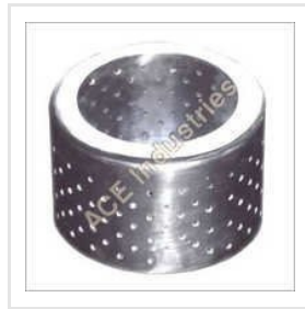
Pilot Scale Centrifuge