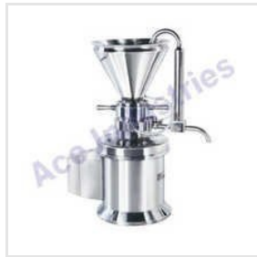
Colloid Mill Machine