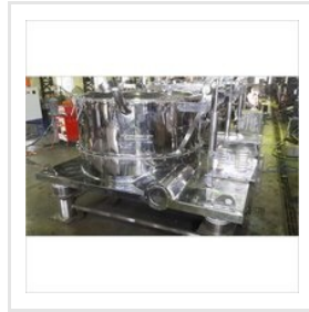
Chemical Centrifuge Machine