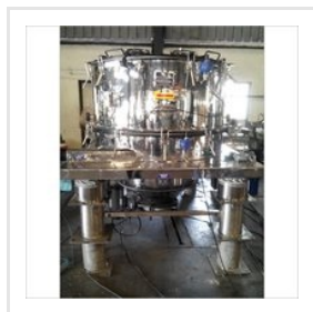
Bottom Discharge Centrifuge