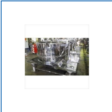
CHEMICAL CENTRIFUGE MACHINE

Air tray Dryer, Automation of Bottom Discharge Centrifuge, Basket Centrifuges, Bottom Discharge Centrifuge, Bottom Discharge Centrifuge Machine, Centrifuge Chemical Plant, Centrifuge Machine, Chemical Centrifuge Machine, Colloid Mill Machine, Colloidal Mill, Compact Cooling Centrifuges, Dome Open Machine with Lifting Bag, Filtration Centrifuge Machine, Fluid Bed Dryer Machine, Four Point Mounting Centrifuge, etc.