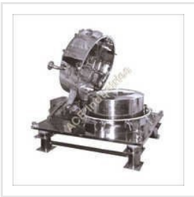
Dome Open Machine With Lifting Bag