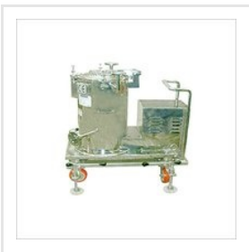
Universal Pilot Scale Centrifuge