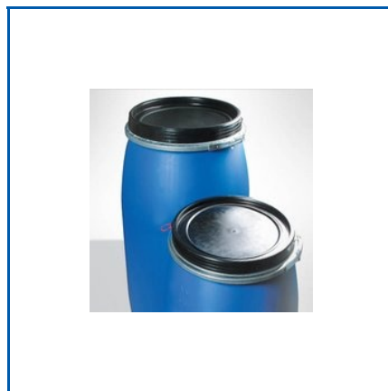
S P ETHOXYLATES