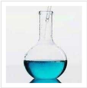
Ceto Stearyl Alcohol Ethoxylate