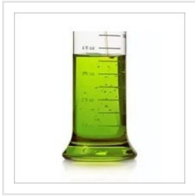
Hydrogenated Castor Oil Ethoxylates