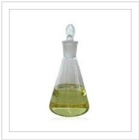
Castor Oil Ethoxylate