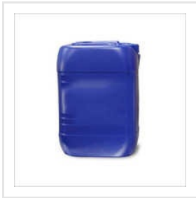
1,4 Butynediol Ethoxylates