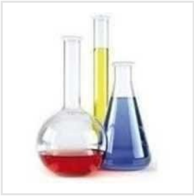
Stearyl Amine Ethoxylates