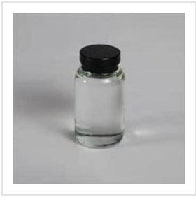
C F Acid Ethoxylates