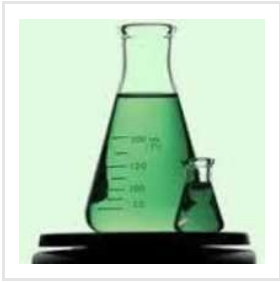
Tridecyl Alcohol Ethoxylates