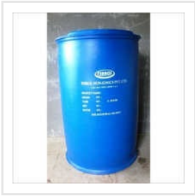
NP 30 Emulsifiers