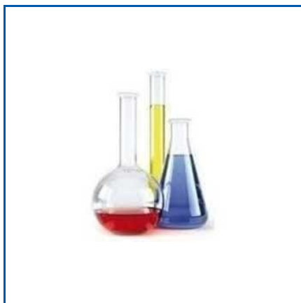
OCTYL PHENOL ETHOXYLATE