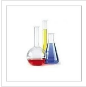
Stearic Acid Ethoxylates