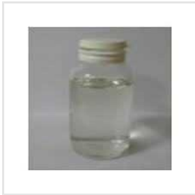
Fatty Amine Ethoxylates