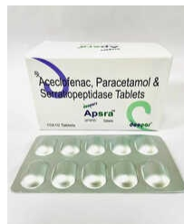
ACECLOFENAC PARACETAMOL AND SERRATIOPEPTIDASE TABLETS