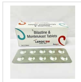
Bilastine And Montelukast Tablets