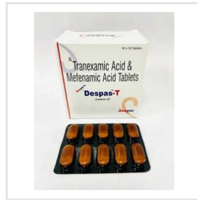
Tranexamic Acid And Mefenamic Acid