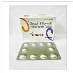
Ofloxacin And Flavoxate HCL Tablets