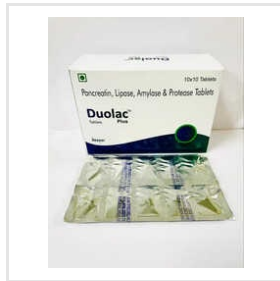
Pancreatin Lipase Amylase & Protease Tablets