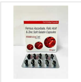
Ferrous Ascorbate Folic Acid And Zinc Sulphate