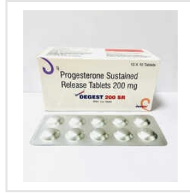
200mg Progesterone Sustained Release