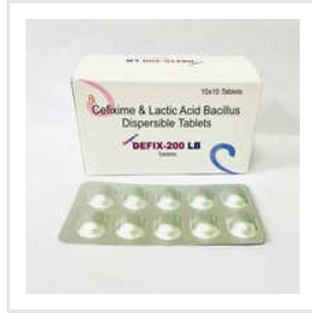
Cefixime And Lactic Acid Bacillus Dispersible Tablets