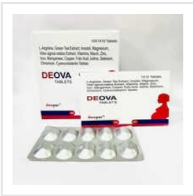
L-Arginine Green Tea Extract Inositol