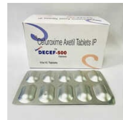
500 MG CEFUROXIME AXETIL TABLETS IP