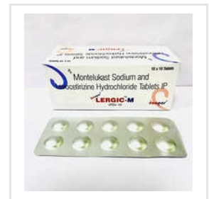
Montelukast Sodium and Levocetirizine Hydrochloride Tablets IP