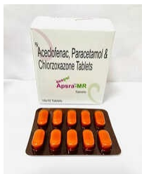
ACECLOFENAC PARACETAMOL AND CHLORZOXAZONE TABLETS

1.125g Ceftriaxone Tazobactam Injection, 100 Mg Acebrophylline Capsules, 100g Ayurvedic Laxative Powder, 100mg L Carnosine Syrup, 100ml Ayurvedic Pain Relief Oil, 100ml B-Complex With Multivitamin Syrup, 100ml Disodium Hydrogen Citrate Syrup, 100ml Levosalbutamol Ambroxol Guaiphenesin Syrup, 100ml Multivitamin Syrup, 100ml Paracetamol Infusion IP, 100ml Silymarin L-Ornithine L-Aspartate B-Complex Syrup, 12g Linezolid Dry Syrup, 150ml Ferrous Ascorbate And Folic Acid Suspension, 15g Cholecalciferol Drops, 15g Itraconazole And Terbinafine Hydrochloride Cream, etc.