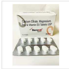
Calcium Citrate Magnesium Zinc And Vitamin D3 Tablets USP