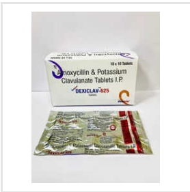
Amoxicillin And Potassium Clavulanate Tablets I.P.