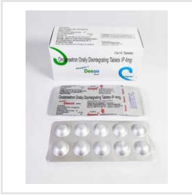
4mg Ondansetron Orally Disintegrating