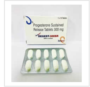
Tablet Natural Micronised