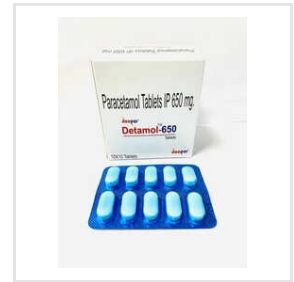
650mg Paracetamol Dispersible Tablets BP