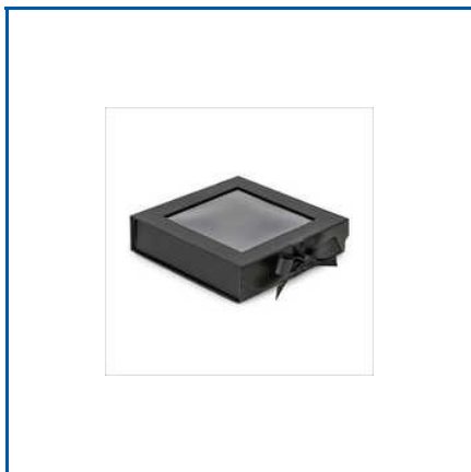
DRAWER TYPE BLACK NECKLACE BOX

Corporate Boxes, Corporate Gift Boxes, Cosmetic Rigid Boxes, Drawer Type Black Necklace Box, Drawer Type Necklace Boxes, Flap Open Necklace Box, Gift Packaging Rigid Boxes, Gift Rigid Square Box, Luxury Jewellery Rigid Boxes, Mockup Rigid Box, Perfume Rigid box, Printed Mockup Rigid Boxes, Raphe Style Necklace Box, Rigid Boxes, Watch Rigid Boxes, etc.