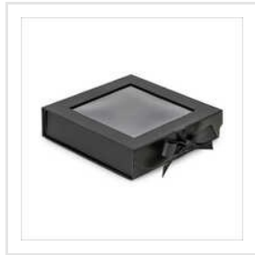
Drawer Type Black Necklace Box