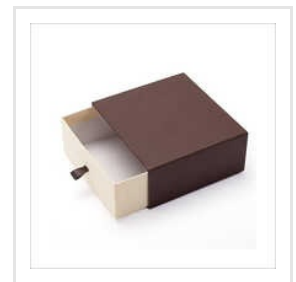
Drawer Type Necklace Boxes