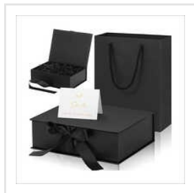
Rapehe Style Necklace Box