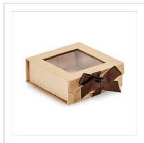
Gift Rigid Square Box