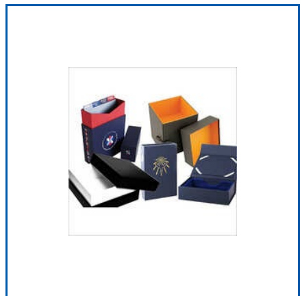
GIFT PACKAGING RIGID BOXES