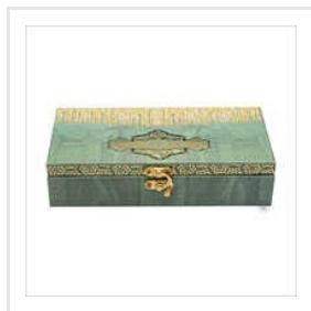
Cosmetic Rigid Boxes