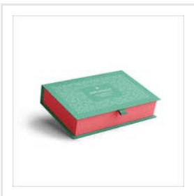
Mockup Rigid Box