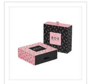
Printed Mockup Rigid Boxes