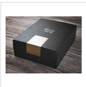
Corporate Gift Boxes