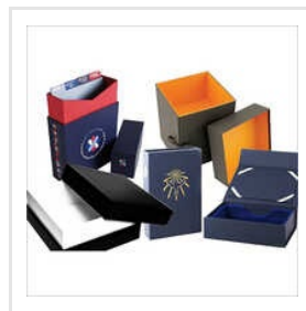
Gift Packaging Rigid Boxes