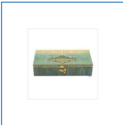
COSMETIC RIGID BOXES