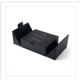
Flap Open Necklace Box