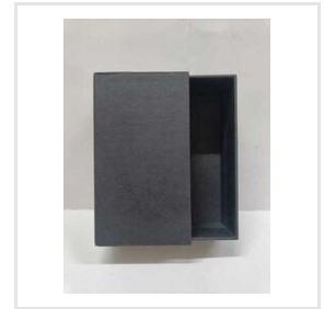
Perfume Rigid Box