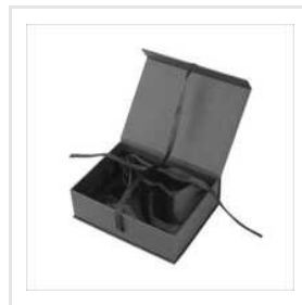
Watch Rigid Boxes