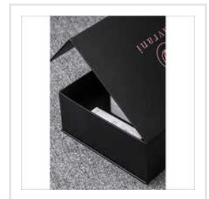
Luxury Jewellery Rigid Boxes