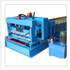
Glazed Roof Tile Forming Machine