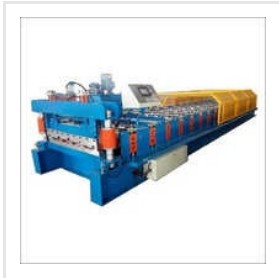
Industrial Roof Sheet Forming Machine