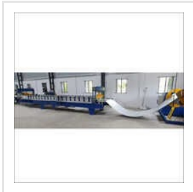
Metal Roof Sheet Forming Machine