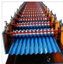
MILD STEEL ROOFING SHEET MAKING MACHINE