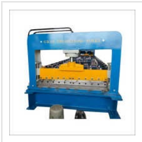
Colored Roofing Sheet Making Machine