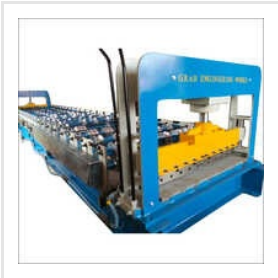
Metal Roofing Structure Making Machine