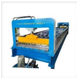
INDUSTRIAL ROOFING SHEET MAKING MACHINE

15 HP Roofing Sheet Making Machine, 20 HP Roofing Sheet Making Machine, Automatic Roofing Sheet Crimping Machine, Automatic Roofing Sheet Making Machine, Automatic Sheet Roll Forming Machine, Automatic Tile roof Sheet Making Machine, Colored Roofing Sheet Making Machine, etc.