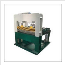
Automatic Roofing Sheet Making Machine