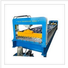
Galvanized Profile Sheet Making Machine