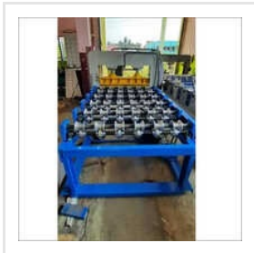
Hydraulic Roll Forming Machine