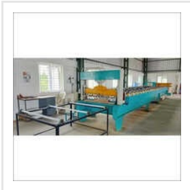
Automatic Sheet Roll Forming Machine