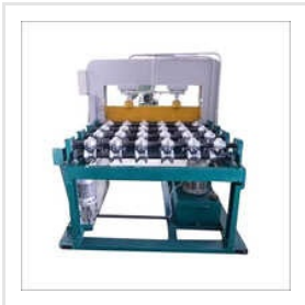
Automatic Roofing Sheet Crimping Machine