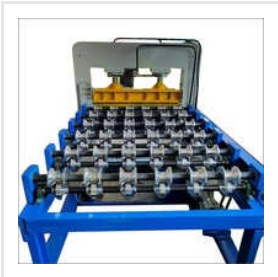
Tile Crimping Machine