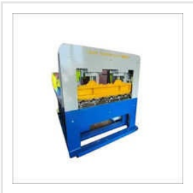
Industrial Roof Tile Forming Machine