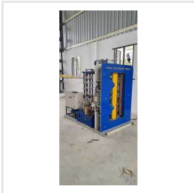
Roofing Sheet Crimping Machine