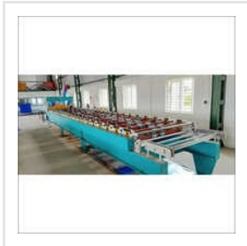
Metal Roofing Sheet Making Machine