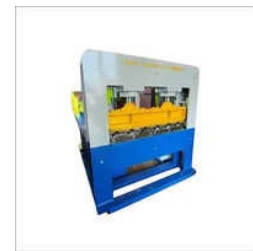
15 HP ROOFING SHEET MAKING MACHINE