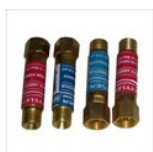
Flash Back Arrestors