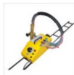
Tigress Mild Steel Cutting Machine