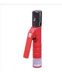
Type A Electrode Holder