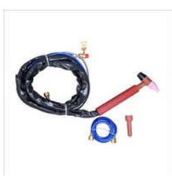
Water Cooled Torch