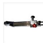
IMC 3 Cutters