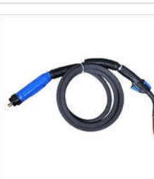
Gas Cooled Welding Torch