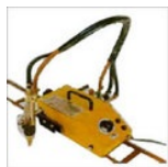
Portable Gas Cutting Machines