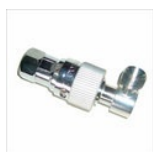
Oxygen Self Sealing