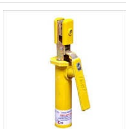
Type B Electrode Holder