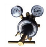
Dura Oxygen Cylinder