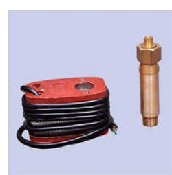
Carbon Dioxide Heater