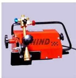
Hind Cutter Machine