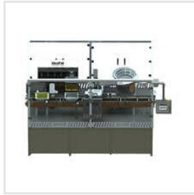
Fully Automatic Type PFS Machine