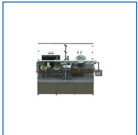
FULLY AUTOMATIC TYPE PFS MACHINE