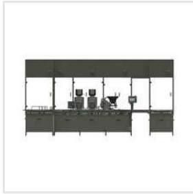
Injectable Dry Powder Filling Machine