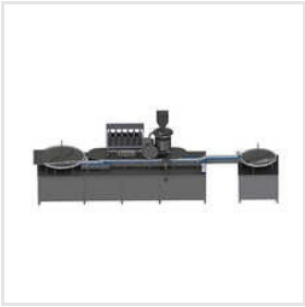
Weight Based Rejection Injectable