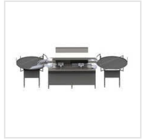
Industrial Visual Inspection Machine