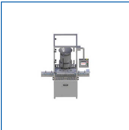
ALLUMINIUM CAP SEALING MACHINE

Alluminium Cap Sealing Machine, Fully Automatic Type PFS Machine, Industrial Visual Inspection Machine, Injectable Dry Powder Filling Machine, Weight Based Rejection Injectable Liquid Filling Machine, etc.