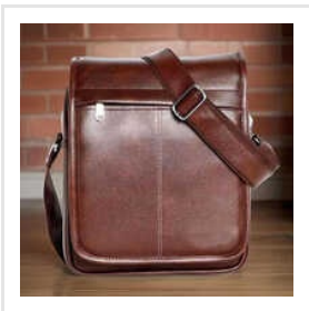
Line Sider Brown Sling Side Office Bag