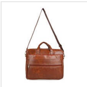
Single Button Tan Attractive Stylish