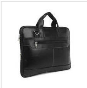
Zip Folding Black Slim Stylish Leather Sling