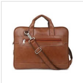
Zip Folding Tan Slim Stylish Leather