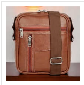
Cross Sider Tan Color Leather Multiple Pocket