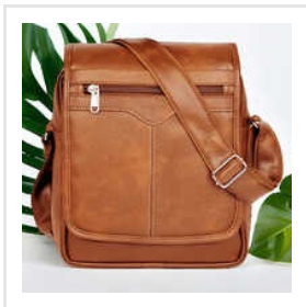
Neck Sider Tan Stylish Unisex Artificial