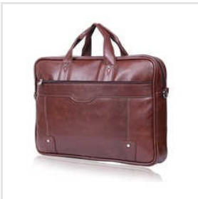
Double Line Brown Leather Messenger Bag