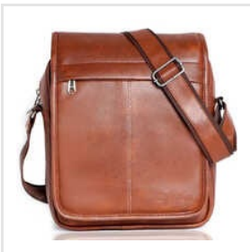
Line Sider Tan Color Sling Side Office Bag