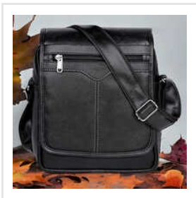
Neck Sider Black Stylish Unisex Artificial