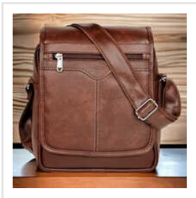
Neck Sider Brown Stylish Unisex Artificial