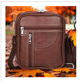
Cross Sider Brown Leather Multiple Pocket