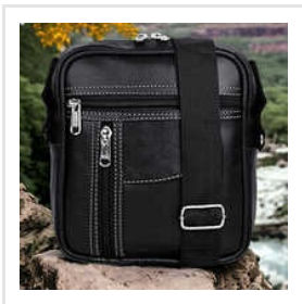
Cross Sider Black Leather Multiple Pocket