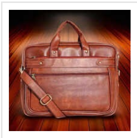
Single Button Tan Stylish Leather Office