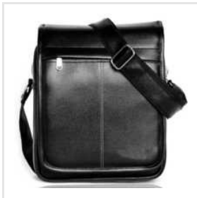
Line Sider Black Sling Side Office Bag