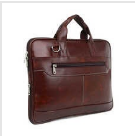
Zip Folding Brown Slim Stylish Unisex Artificial