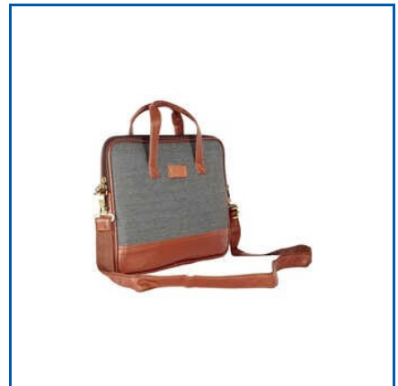
JUTE MESSENGER STYLISH LEATHER JUTE OFFICE MESSENGER BAG