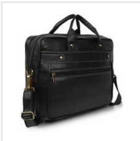
Single Button Black Attractive Stylish