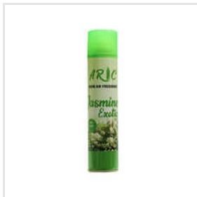
Jasmine Exotic Room Air Freshener