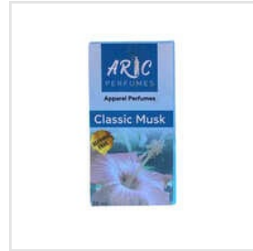
Classic Musk Apparel Perfume