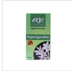
Rajanigandha Apparel Perfume