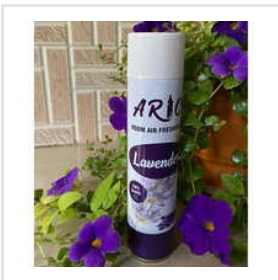
Lavender Room Air Freshener