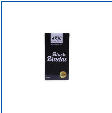
BLACK BINDAS APPAREL PERFUME