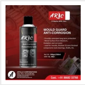
Anti-Corrosion Protection Spray