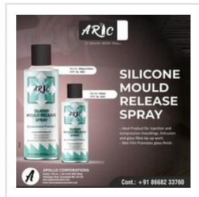
Silicone Mould Release Spray