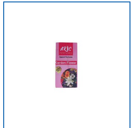
30ML GARDEN FLOWER APPAREL PERFUME