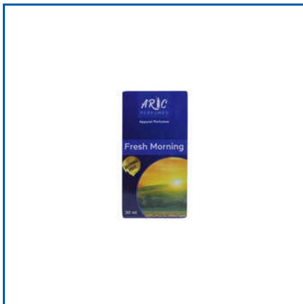
30ML FRESH MORNING APPAREL PERFUME

30ml Fresh Morning Apparel Perfume, 30ml Garden Flower Apparel Perfume, Anti-Corrosion Protection Spray, Black Bindas Apparel Perfume, Classic Musk Apparel Perfume, Garden Rose Room Air Freshener, Jasmine Exotic Room Air Freshener, Lavender Room Air Freshener, Lemon Country Room Air Freshener, Rajanigandha Apparel Perfume, Sandal Mantra Room Air Freshener, Silicone mould release spray, etc.