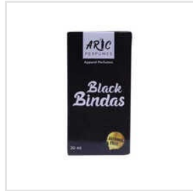
Black Bindas Apparel Perfume