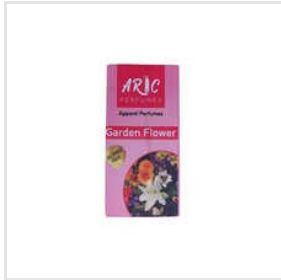
30ml Garden Flower Apparel Perfume