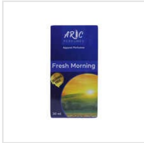
30ml Fresh Morning Apparel Perfume