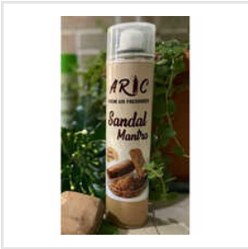
Sandal Mantra Room Air Freshener