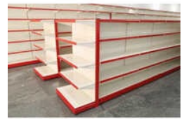
SUPER MARKET RACKING