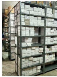
LIGHT DUTY RACKING