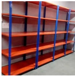
MEDIUM DUTY RACKING