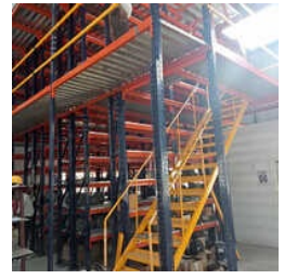
MULTI TIER RACKING