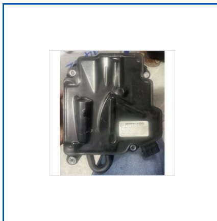
MERCEDES ISM MODULE