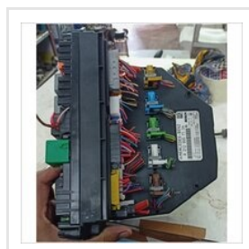
Mercedes Front Fusebox