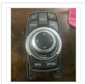
BMW Drive 10 Pin