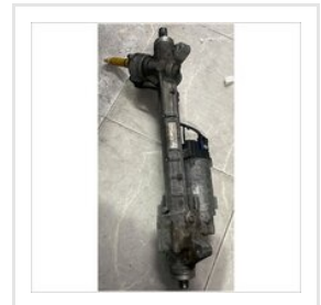
Mercedes GL Steering Rack