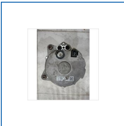
5 AUDI AND PORSCHE ALTERNATOR

5 Audi And Porsche Alternator, All Luxury Cars Engine, All Steering Rack, Audi A4 A6Q5 Steering Rack, Audi A8 Meter, Audi Air Suspension Control Module, Audi Mercedes BMW All Doors, Audi Q7 ABS Pump, Audi Q7 Amplifier, Audi Q7 Sunroof Motor, BMW Drive 10 Pin, BMW 7 Series Airmatic Module, Mercedes 212 Display, Mercedes 651 Engine ECM, Mercedes AC Panel, etc.