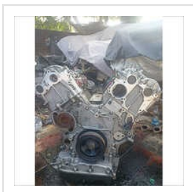
All Luxury Cars Engine