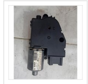
Audi Q7 Sunroof Motor