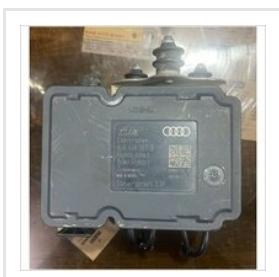
Audi Q7 ABS Pump