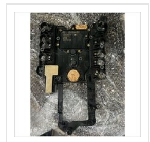
Mercedes VGS Plate