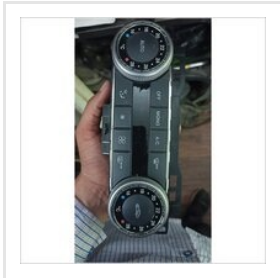
Mercedes AC Panel