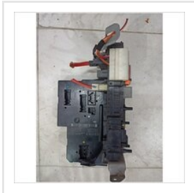
Mercedes Rear Fuse Box