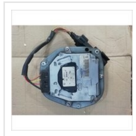
Mercedes Fan Motor