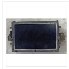
Mercedes 212 Display