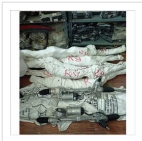
All Steering Rack