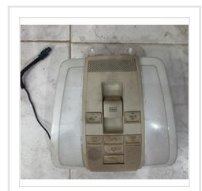
Mercedes Sunroof Panel