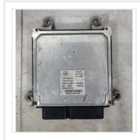
Mercedes 651 Engine ECM