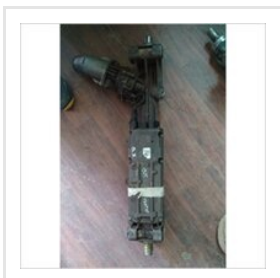
Audi A4 A6Q5 Steering Rack