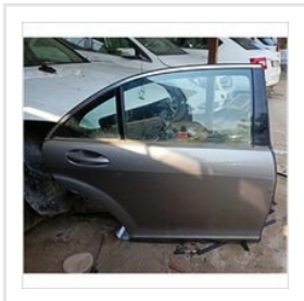
Audi Mercedes BMW All Doors