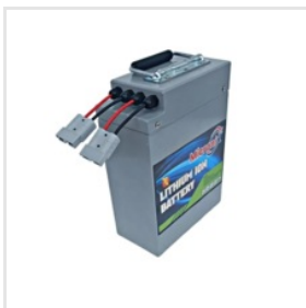
Two Wheeler Battery