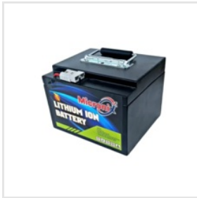
48V 31.2AH Li-Ion Battery With BMS