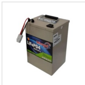
60V 42AH Lfp Battery