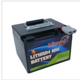
60V 26AH Li-Ion Battery With Bms