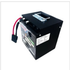
72V 30AH Li-Ion Battery