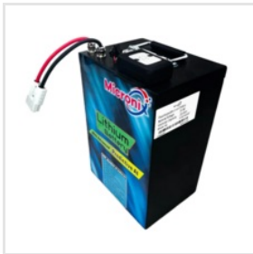
51.8V 20AH Li-Ion Battery