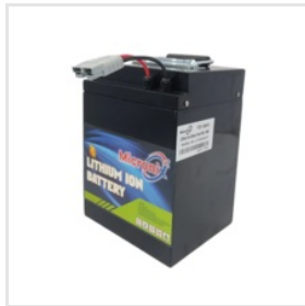
72V 41.6AH Li-Ion Battery