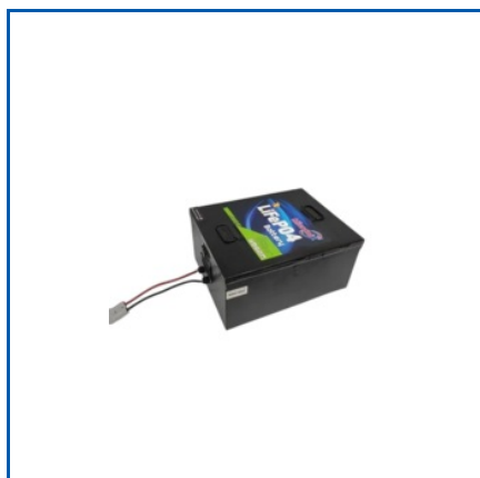
60V 30AH LFP BATTERY

01_Medical Equipments Battery, 02_Medical Equipments Battery, 11.1V 18AH Li-Ion Battery Pack, 12.8V 100AH Inverter Battery, 12.8V 12AH Lifepo4 Battery, 12.8V 12AH Solar Street Light Battery, 12.8V 18AH Solar Street Light Battery, 12.8V 24AH Solar Street Light Battery, 12.8V 30AH Solar Street Light Battery, 12.8V 30H Lifepo4 Battery, 12.8V 36AH Solar Street Light Battery, 12.8V 42AH Solar Street Light Battery, 12.8V 54AH Lifepo4 Battery For Solar, 12.8V 60AH Inverter Battery, 12.8V 6AH Solar Street Light Battery, etc.