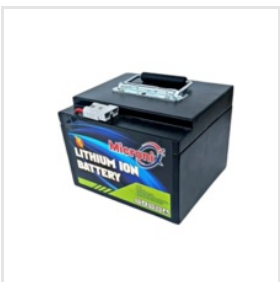
48V 20.8AH Li-Ion Battery