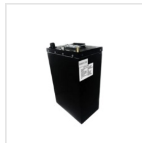
72V 40AH NMC Li-Ion Battery