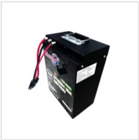
Electric Two Wheeler Battery