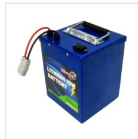
60V 36AH Li-Ion Battery