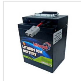
72V 35AH Li-Ion Battery