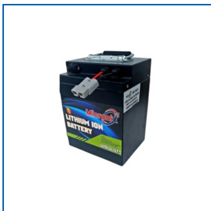
LITHIUM ELECTRIC BATTERY