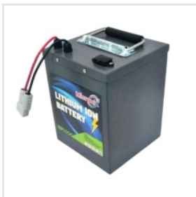
62.9V 36AH Li-Ion Battery Pack