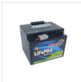
48V 30AH Lfp Battery