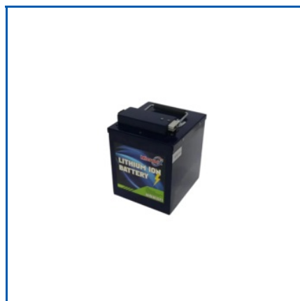
ELECTRIC VEHICLE BATTERY