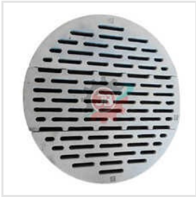
CI Boiler Jali