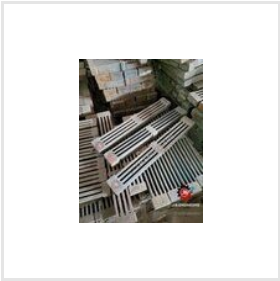
Fire Bar For Boiler