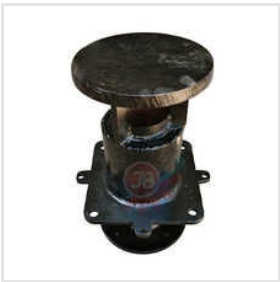
Industrial Coal Nozzle