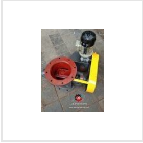
Ci Rotary Airlock Valve