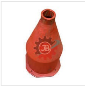
CI Boiler MDC Cone