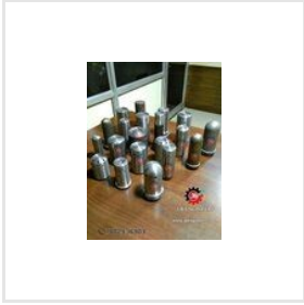
Boiler Air Nozzles