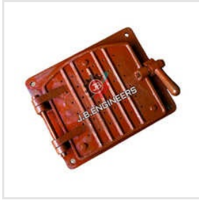
Boiler Fire Door