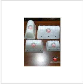
Plastic Elevator Bucket