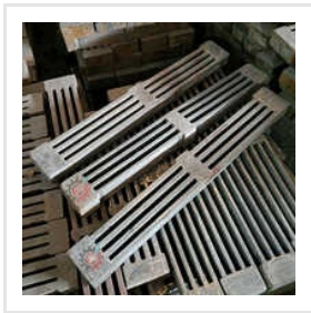
Boiler Fire Bar