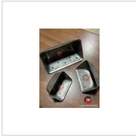
MS Elevator Buckets