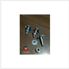
Elevator Bucket Bolt