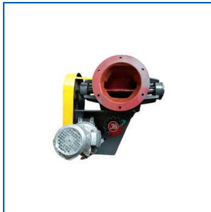
ROTARY AIRLOCK VALVE