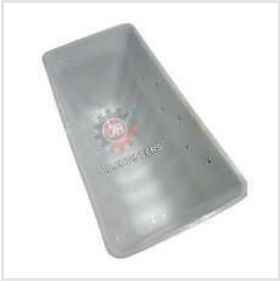
Industrial Elevator Bucket