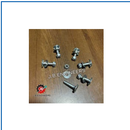
SS ELEVATOR BUCKET BOLT

Air Nozzle For Boiler Power Plant, Boiler Air Nozzle, Boiler Air Nozzle SS304, Boiler Air Nozzles, Boiler Bed Air Nozzle, Boiler Bed Air Nozzles, Boiler Fire Bar, Boiler Fire Door, Boiler Fire Door Thermax, Boiler Furnace Door With Peep Hole, Boiler Furnace Fire Door, Boiler Peep Hole Fire Door, CI Boiler Fire Door, CI Boiler Jali, CI Boiler MDC Cone, etc.