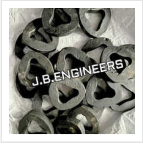
Manganese Steel Crusher Hammer