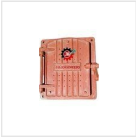
Ci Boiler Fire Door