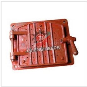
CI Boiler Fire Door