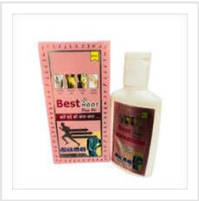
60ml Pain Relief Oil