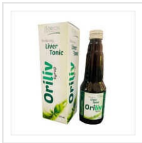
Herbal Liver Tonic Syrup