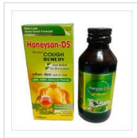
Herbal Cough Syrup FOR THIRD PARTY