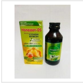
Herbal Third Party Manufacturing