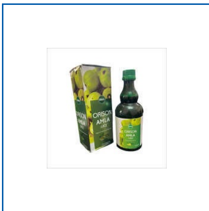
500ML NATURAL AMLA JUICE

225ml Sundri Ratan Ayurvedic Tonic, 500ml Natural Amla Juice, 60ml Pain Relief Oil, Acelofenac.+paracetamolMg.+Serratio tablet, Albendazole + Ivermectin bolus, Albendazole + Ivermectin suspension, Albendazole Bolus, Albendazole bolus, Albendazole suspension, Alpha-Beta Arteether injection, Amitraz Dip Concentrate, Amoxicillin + Cloxacillin INJECTION, Amoxycillin + Sulbactum, Amoxycillin + Potassium Clavulanate injection, etc.