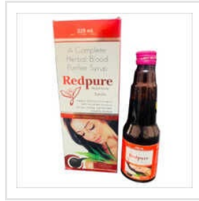
Herbal Blood Purifier Syrup