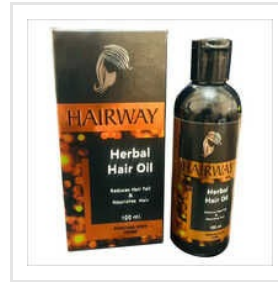
Herbal Hair Oil