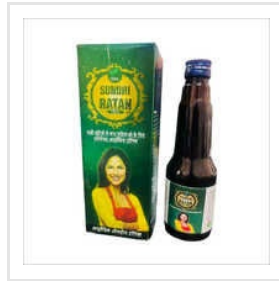
225ml Sundri Ratan Ayurvedic Tonic