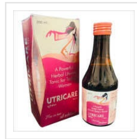
Herbal Uterine Tonic For Women