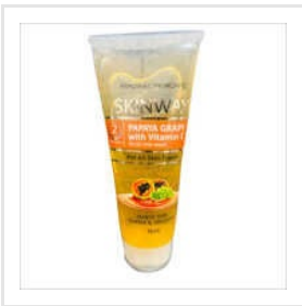
Scrub Face Wash