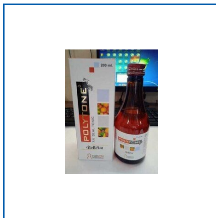
MULTIVITAMIN SYRUP FOR THIRD PARTY MANUFACTURING