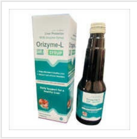
Liver Protector With Enzyme Syrup For Third