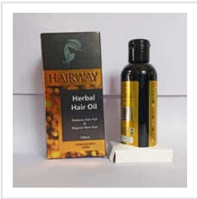
Herbal Oil For Third Party Manufacturing