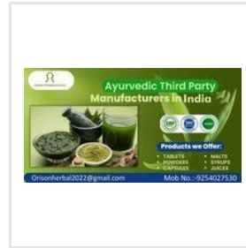
AYURVEDIC SYRUP THIRD PARTY