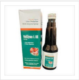
Liver Protector Syrup For Third Party