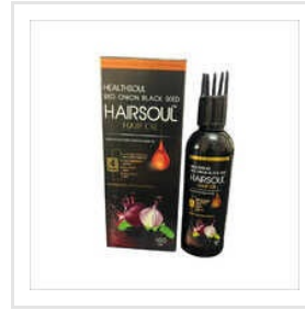
Red Onion Black Seed Hair Oil