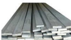
Industrial Mild Steel Flat Bar