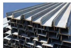
Mild Steel Slotted C Channel