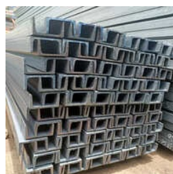
C Shape Mild Steel Channel