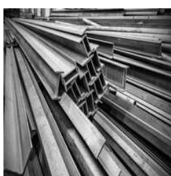
Mild Steel Joist Beam Bar