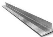
L SHAPED MILD STEEL ANGLE