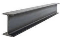
Mild Steel Structural Steel Beam