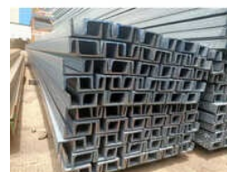
Mild Steel C Channel