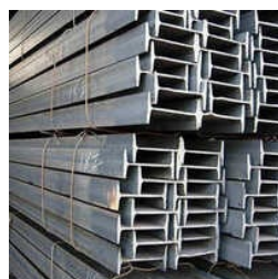
Industrial Mild Steel Joist Bar