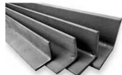
Mild Steel Angles