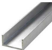
Mild Steel U Channel