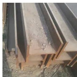
H Shaped Mild Steel Beam