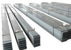
High Quality Mild Steel Flat Bar