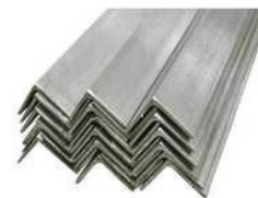
V SHAPE MILD STEEL ANGLE