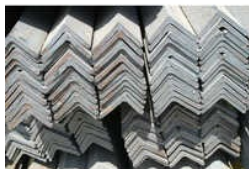
METAL L ANGLE

10mm Mild Steel Square Pipe, 12 m Mild Steel Railway Track, 12mm Mild Steel Square Pipe, Blue Color Coated Roofing Sheet, C Shape Mild Steel Channel, Color Coated Roofing Sheet, Dadu Mild Steel Round Pipe, E250 Hot Rolled Sheets, H Shaped Mild Steel Beam, High Quality Mild Steel Channel, High Quality Mild Steel Flat Bar, I Shape Mild Steel Beam, Industrial Mild Steel Channel, Industrial Mild Steel Flat Bat, Industrial Mild Steel Joist Bar, etc.