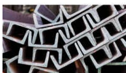
Mild Steel U Shape Channel