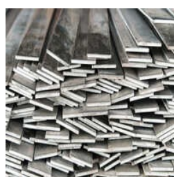
Mild Steel Flat Patti