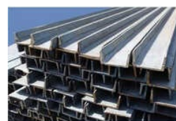
Industrial Mild Steel Channel