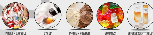
TABLET / CAPSULE

Since we consider quality a 'precious segment,' so that's why most of our products are manufactured by our faithful vendors 'special manufacturing units. Under their top-standard supervision, we bring out perfection in every product.