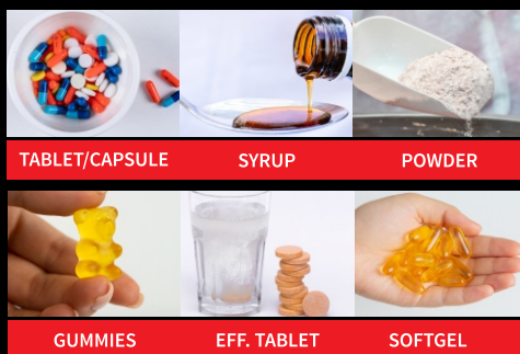
TABLET/CAPSULE SYRUP POWDER GUMMIES EFF. TABLET SOFTGEL