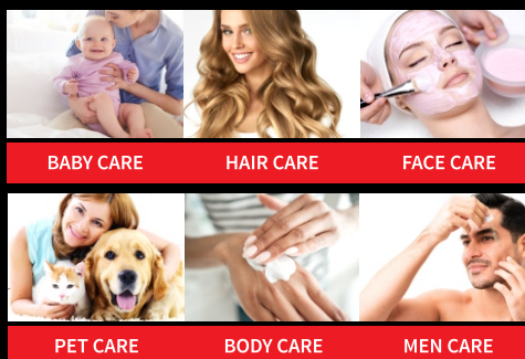
BABY CARE HAIR CARE FACE CARE PET CARE BODY CARE MEN CARE

We provide Third-Party Manufacturing in India for Ayurvedic Herbal Products, Cosmetic Products, and many more. We never manufacture superior quality products individually, but we trust some reliable partner, and it's because of their collaboration, we're flourishing beautifully in this industry.