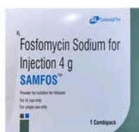
4GM FOSFOMYCIN SODIUM FOR INJECTION

0.5ml Hepatitis B Immunoglobulin, 1.5gm Cefuroxime Sodium Injection, 1.5gm Sulbactam and Cefoperazone For Injection, 1.5ml Recombinant Human Growth Hormone Injection, 100 mg Remdesivir for Injection, 10000 Injection, 1000mg Meropenem Injection IP, 100mg Gemcitabine Injection IP, 100mg Minocycline For Injection USP, 100mg Minocycline for Injection, 100mg Paclitaxel for Injectable Suspension, etc.