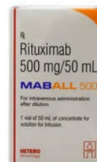
500mg Rituximab Infusion