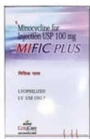
100mg Minocycline For Injection