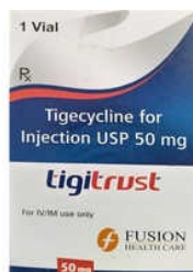
Tigecycline For Injection USP