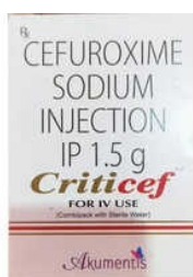
1.5gm Cefuroxime Sodium Injection