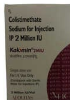
Colistimethate Sodium For Injection