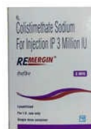
Remergin Colistimethate Sodium