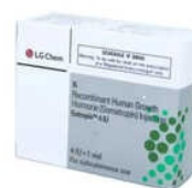
RECOMBINANT HUMAN GROWTH HORMONE INJECTION