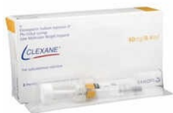
40mg Enoxaparin Sodium Injection IP