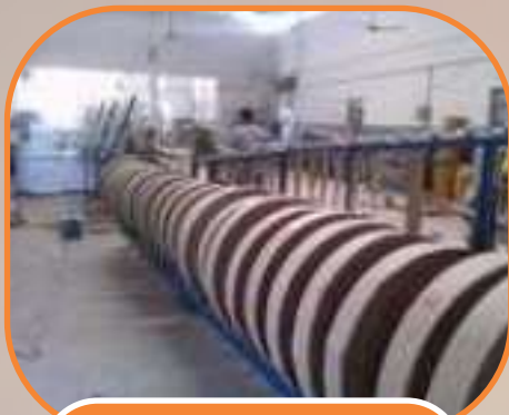
Paper Tube Reel Stand Machine