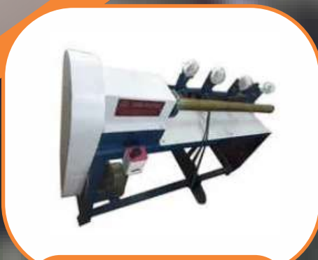
Paper Tube Trimming Machine