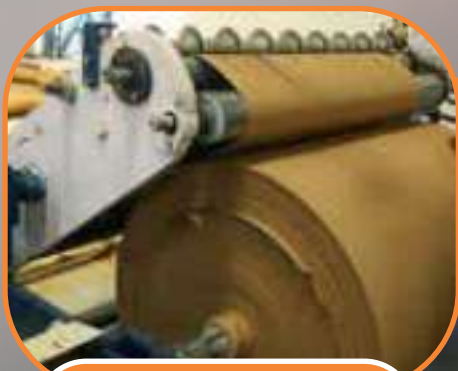
Paper Tube Slitting Machine