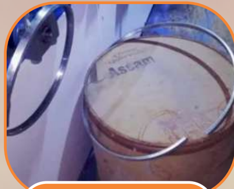
Fibre Drum Lock Ring Forming Machine