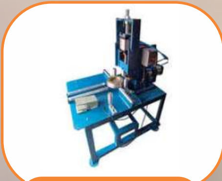
Fibre Drum Ring Forming Machine