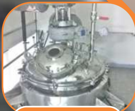
Soft Gelatin Plant