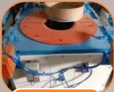
Fibre Drum Bottom Fixing Machine