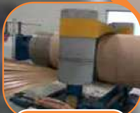
Paper Tube Spiral Winder Machine