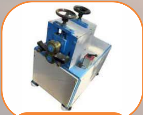
Fibre Drum Lock Ring Forming Machine