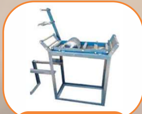
Paper Tube Top Layer Machine