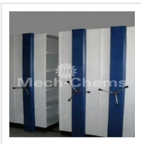
Stainless Steel Mobile Storage System