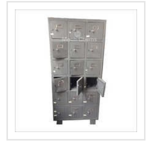
Industrial Metal Locker