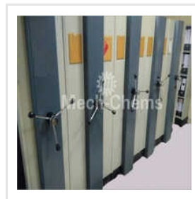
Compactor Storage Racks