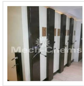
Mobile Storage Systems