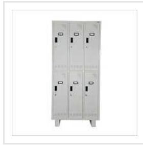
Industrial Storage Locker