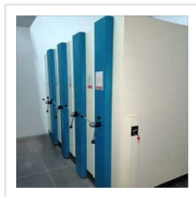
Mobile Shelving Systems