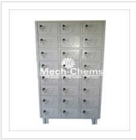
Industrial 24 Door Locker