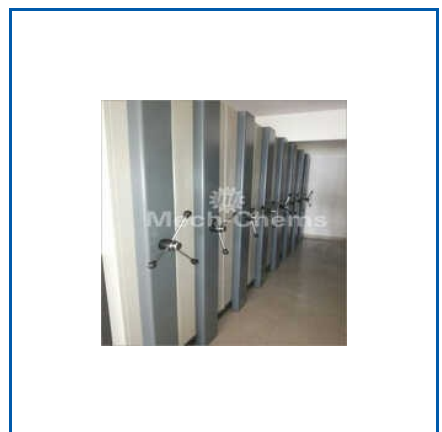
FILE STORAGE COMPACTOR