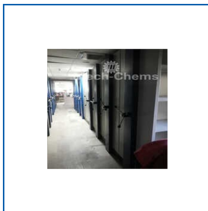
MOBILE STORAGE COMPACTORS