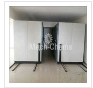
Mobile Storage File Compactor