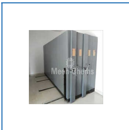
MECHANICAL MOBILE COMPACTOR

12 Doors Industrial Steel Locker, 3 Drawer Foolsap Filing Cabinet, 4 Drawers Index Card Cabinet, 6 Door Industrial Locker, 6 Drawer Filing Cabinets, Cell Phone Lockers, Cell Phone Storage Locker, Compactor Mobile Racks, Compactor Storage Racks, Drawer Cabinets, Drum Pallet Racks, File Storage Compactor, Fire Protection Filing Cabinets, Fire Resistant Filing Cabinet, Glass Door Cupboard, etc.