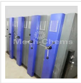
Mobile Compactor Shelving