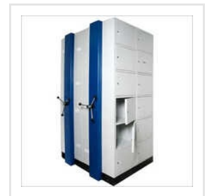
Industrial Compactor Storage System