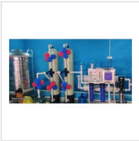
Kily 500 Ltr Hr Commercial RO Water