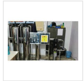
HPC Stainless Steel Mineral Water RO Plant