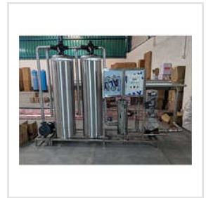
Commercial Water Treatment System