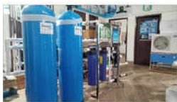
WATER PURIFICATION FILTER SYSTEM

1000 LPH FRP RO Plant, 1000 LPH Ro Machine, 1000 LPH Water Purification Plant, Automatic FRP RO Plant, Commercial Water Treatment System, HPC Stainless Steel Mineral Water RO Plant, Industrial Water Treatment Plant, Kily 500 Ltr hr Commercial RO Water Plant, Water Purification Filter System, etc.