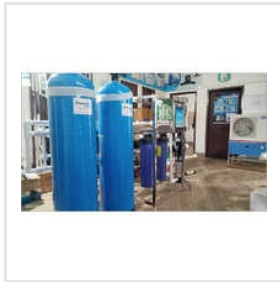
Water Purification Filter System