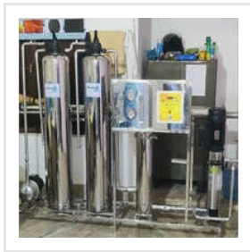
1000 LPH Water Purification Plant