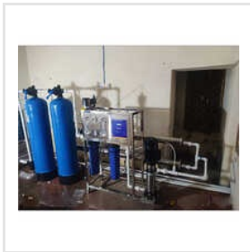
Industrial Water Treatment Plant