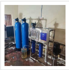
1000 LPH FRP RO Plant