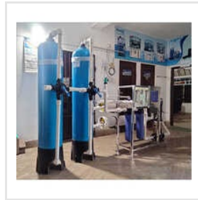
Automatic FRP RO Plant