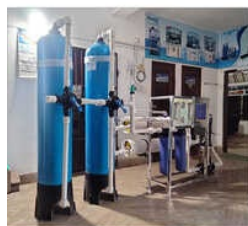
AUTOMATIC FRP RO PLANT