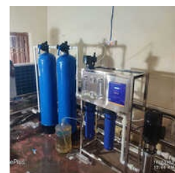
1000 LPH FRP RO PLANT