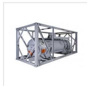
Liquid Bromine ISO Container