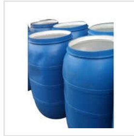
Industrial Plastic Barrel