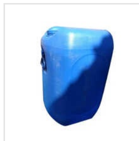
35 Ltr Blue Plastic Can