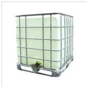
Industrial IBC Tank