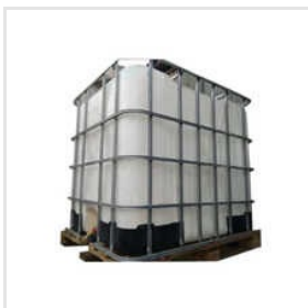
IBC White Tank