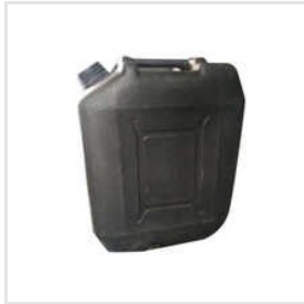
Black Plastic Jerry Can