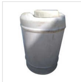
Plastic Jerry Can