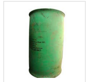
Plastic Green Drum