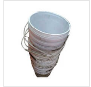
Plastic White Bucket