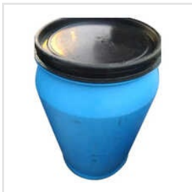
Plastic Blue Barrel