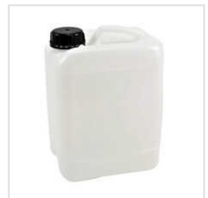
White HDPE Jerry Can