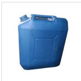
Blue Plastic Can