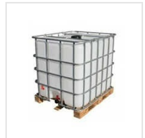
Industrial IBC White Tank