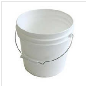
Plastic Paint Bucket