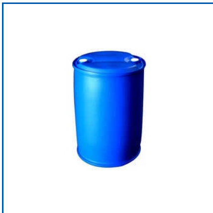
PLASTIC BARREL DRUM

35 Ltr Blue Plastic Can, Black Plastic Can, Black Plastic Jerry Can, Blue Plastic Can, Blue Plastic Crates, HDPE Plastic Blue Drums, IBC Container Composite Base 3400, IBC Container Full MS Base And Cover 4000, IBC Container MS Base (Pallet) 3500, IBC Container Wooden Base 2800, IBC White Tank, Industrial IBC Tank, Industrial IBC White Tank, Industrial Plastic Barrel, Industrial Plastic Bucket, etc.