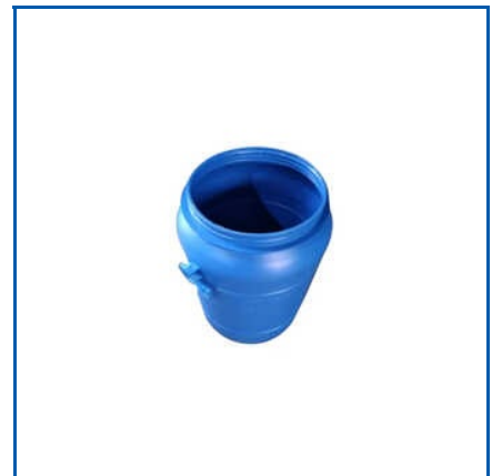
PLASTIC BLUE DRUM