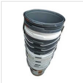
Industrial Plastic Bucket