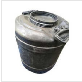
Black Plastic Can