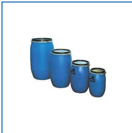
HDPE PLASTIC BLUE DRUMS