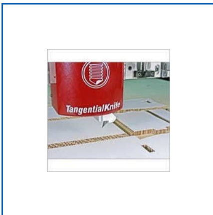
CNC KNIFE SYSTEMS

CNC Engraving, CNC Knife Systems, CNC Plastic Cutting Machine, CNC Wood Carving, Cnc Router Machine, Custom Routers, Infinite 2000 Series, Infinite 4000 Series, Infinite 5000 Series, Innovator 4x4, Innovator 5x8, METALWorker 4000 Series, METALWorker 5000 Series, METALWorker 6000 Series, PANELBuilder 5000 Series, etc.