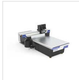
METALWorker 4000 Series