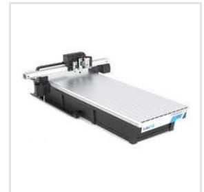
PANELBuilder 5000 Series