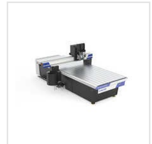
METALWorker 5000 Series