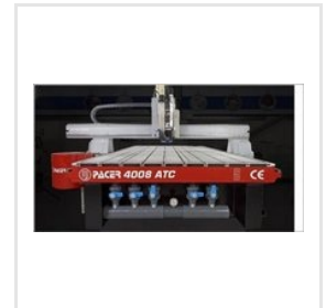
CNC Plastic Cutting Machine