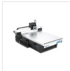
Infinite 2000 Series