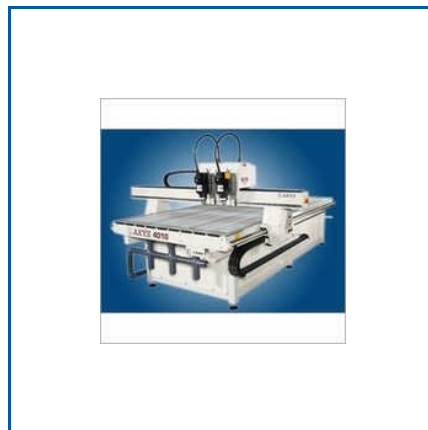
CNC ROUTER MACHINE