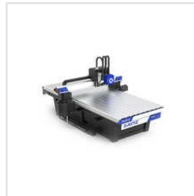
Trident 5000 Series