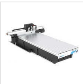
PANELBuilder 6000 Series