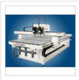
Cnc Router Machine