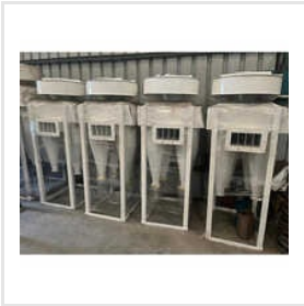
Industrial Multi Cyclone