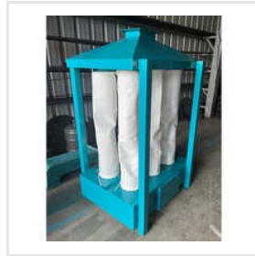
Industrial Post Filter