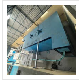
Overhead Conveyor Powder Coating Plant