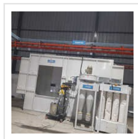
Conveyor Type Powder Coating Booth