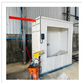
Industrial Powder Coating Booth