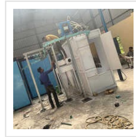
Conveyor Powder Coating Plant