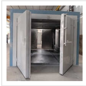
Batch Type Gas Fire Oven