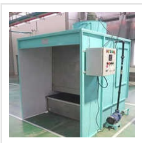
Industrial Paint Spray Booth