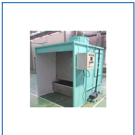
INDUSTRIAL PAINT SPRAY BOOTH