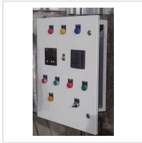
Electrical Panel Bord