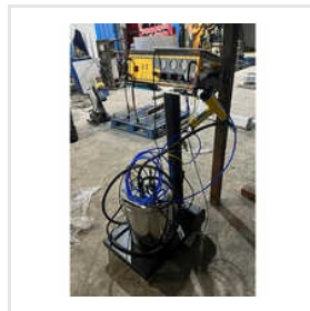
Powder Coating Spray Gun