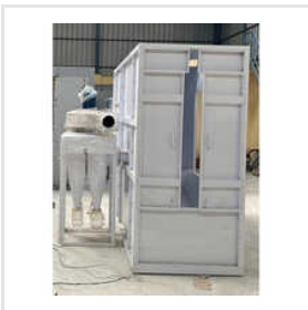
Powder Coating Spray Booth