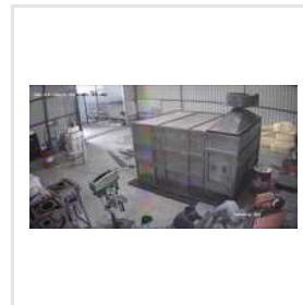
Water Screen Painting Booth