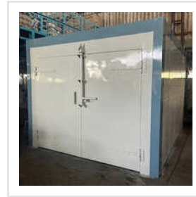
Batch Type Powder Coating Oven