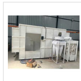
Back To Back Powder Coating Booth