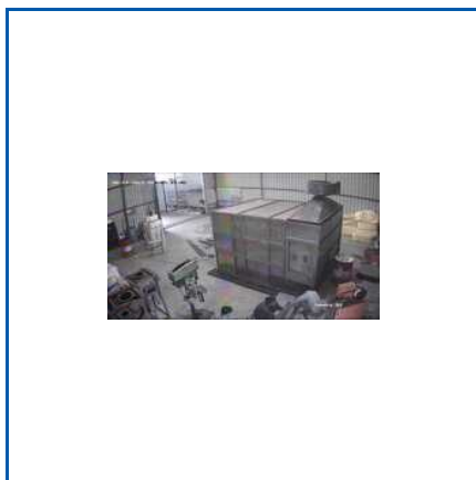
WATER SCREEN PAINTING BOOTH