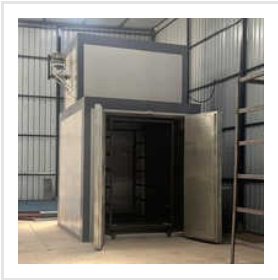
Industrial Batch Powder Coating Oven