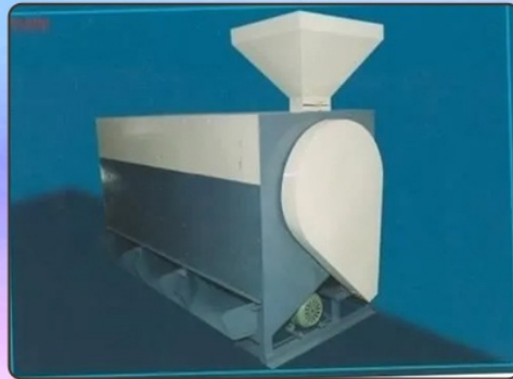
Supari Sorting Machine