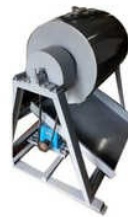
Drum Round Mixer