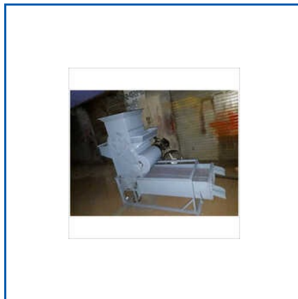
GARLIC BREAKING WITH GRADING MACHINE