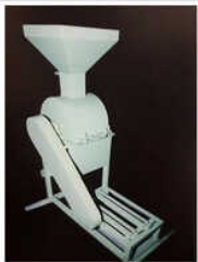
Corn Grinding Machine