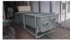
Cardamom Grading Machine