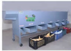
Makhana Roaster Processing Machine