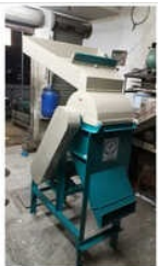
Dung Powder Crusher Machine