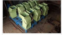
Hand Operated Groundnut Peanut