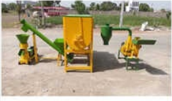
Animal Pellet Feed Making Machines