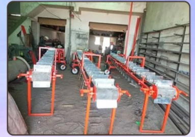
Brick Conveyor Belt

Animal Pellet Feed Making Machines, Areca Nut Grading Machine, Brick Conveyor Belt, Cardamom Grading Machine, Corn Grinding Machine, Drum Round Mixer, Dung Powder Crusher Machine, Garlic Breaking With Grading Machine, Hand Operated Groundnut Peanut Decorticator, High Speed Dispenser Mixer, Khadh Sorting Grading Machine, Makhana Roaster Processing Machine, Masala Powder Separator Machine, Roasted Peanut Skin Remove, Round Grader Machine, etc.