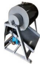
Silica Colour Powder Mixer