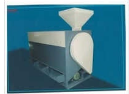
Supari Sorting Machine