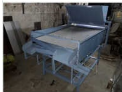
Separator Grading Machine