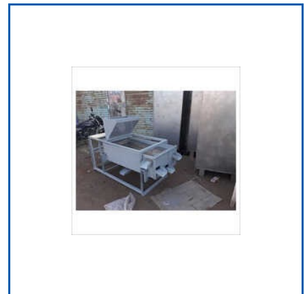
KHADH SORTING GRADING MACHINE