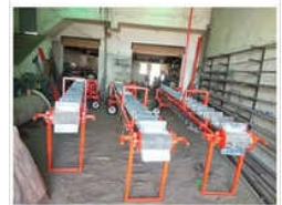
Brick Conveyor Belt