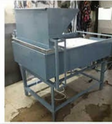
Masala Powder Separator Machine