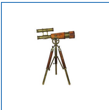
ANTIQUE FINISH ADJUSTABLE BROWN WOODEN STAND FLOOR STANDING TRIPOD

12 Inch Brass Telescope with Adjustable Wooden Tripod Stand, 16 Inch Antique Brass Nautical Telescope with Glass Wooden Box, 16 Inch Black Brass Telescope with Box, 20 Inch Vintage Brass Telescope Victorian 1915 Nautical Antique Wooden Gift Box, 27 Inch Brown Stand Telescope, 4 inch Handicraft Antique Vintage Brass Telescope Binocular, etc.