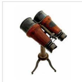
Brass Binocular Leather Antique Desk