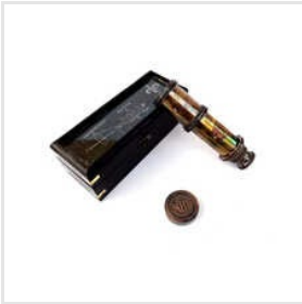
16 Inch Antique Brass Nautical Telescope