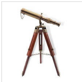
12 Inch Brass Telescope With Adjustable