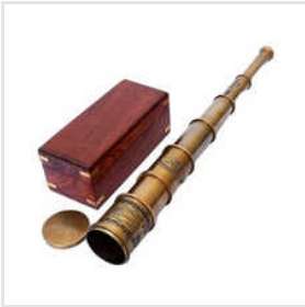
20 Inch Vintage Brass Telescope Victorian