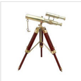
Double Barrel Brass Telescope With