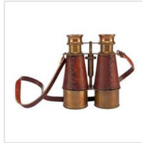
Antique Brass Victorian Marine 1915