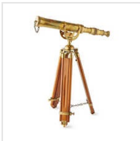
27 Inch Brown Stand Telescope