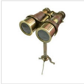
Antique Binocular Telescope With