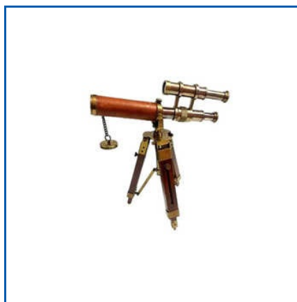
9 INCH BRASS DOUBLE BARREL TELESCOPE MARINE SPYGLASS ANTIQUE FINISH WITH WOODEN TRIPOD STAND