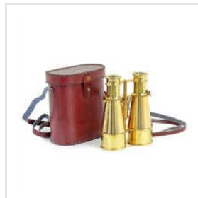
6 Inch Full Brass Binoculars With