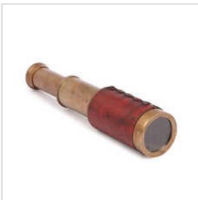
6 Inch Brown Antique Marine Brass Spyglass