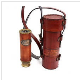
Red Brass Maritime Vintage Telescope