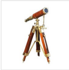
Antique Brass Leather Telescope Nautical