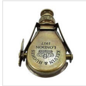
4 Inch Handicraft Antique Vintage Brass