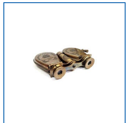
ANTIQUE BRASS POCKET BINOCULAR