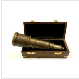
Vintage Brass Telescope Antique 20