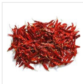
Dry Red Chilli